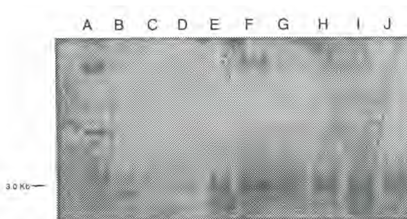
Figure 2. Southern blot analysis of the GUS gene in transformed American chestnut cultures. Lane A, DNA molecular weight markers. Lane B, pBI121.1 digested with EcoRI and HindIII. Lane C, nontransformed cell line. Lanes D-J, transformed cell lines.

Microprojectile bombardment produced 16 putatively transformed cell lines. Approximately 8 weeks after bombardment, kanamycin-resistant colonies of cells were visible against a background of senescent cells. Each resistant colony was transferred to its own plate of fresh selection medium to continue growth. Approximately 10 weeks later, each putatively transformed line was tested for expression of the GUS reporter gene, using both the fluorescence assay and the histochemical assay. Of the 16 kanamycin-resistant lines, 11 were GUS positive and 5 had no GUS activity detectable by the X-gluc or MUG assays. Following 6 months of maintenance on selection medium, Southern blot analysis was performed on seven GUS positive cell lines. The GUS gene was detected in all seven lines (Fig. 2). To date, no mature somatic embryos have been produced from these transformed cell lines. However, all of the transformed lines were derived from a single embryogenic American chestnut suspension culture which had only infrequently produced well-formed somatic embryos prior to the gene transfer experiments. Other, more highly embryogenic lines are available for bombardment, and we intend to apply what we have learned to date to obtain transgenic somatic embryos from those lines.