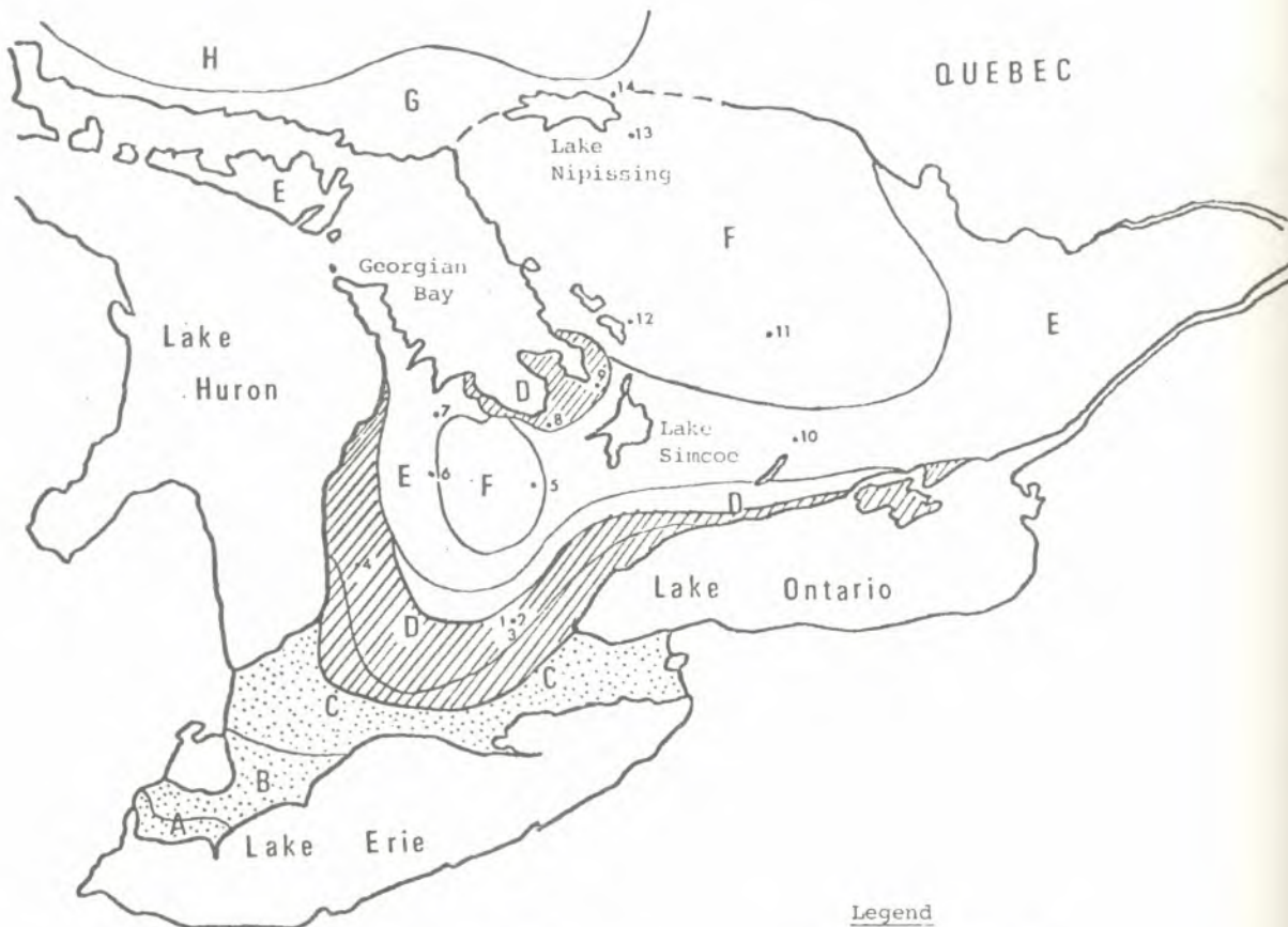
Fig.2 - Location of the tulip poplar (1) Plots in the climatic zones of southern Ontario (2) Natural and potential range of Tulip Poplar in Ontario.