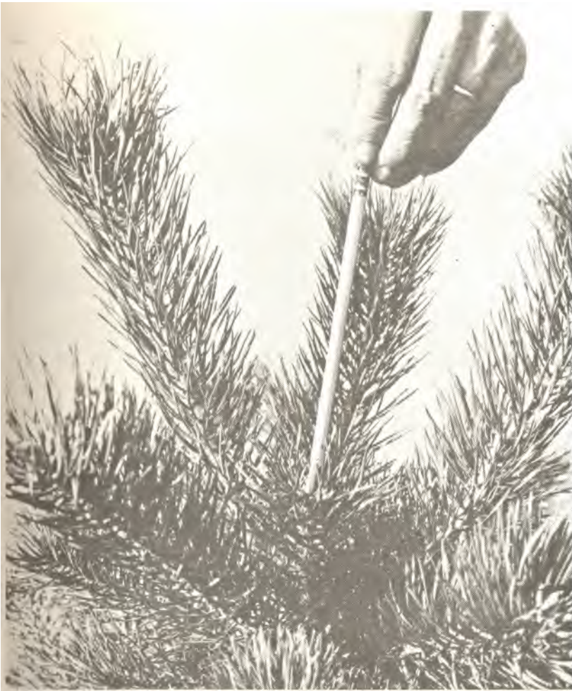
Figure 2.-- Lateral branches of current year extending above the terminal leader (indicated by pencil) as result of formation of lammas shoot growth in previous season in Scotch pine.