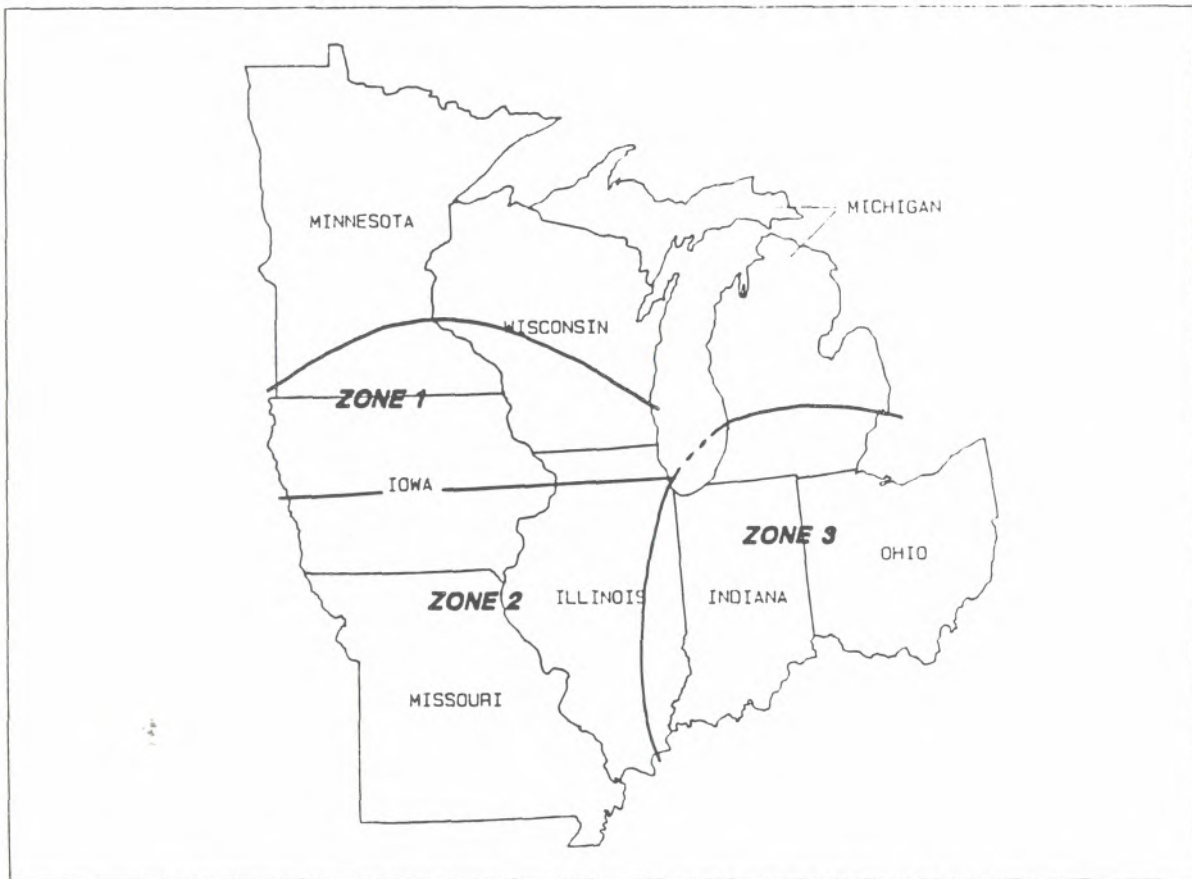
Figure 2. Tentative black walnut breeding zones.

To begin implementing this strategy, three tentative breeding zones were established by the Co-op (Figure 2). Zone 1 includes Wisconsin, Minnesota,