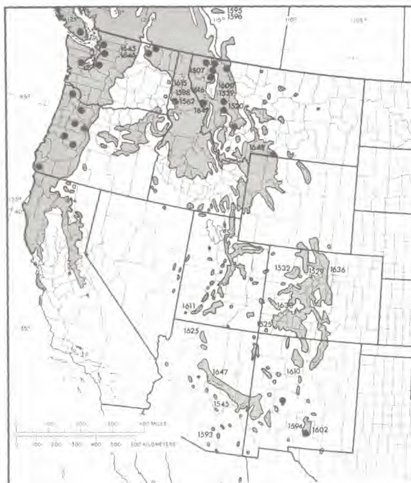
Figure 1.-- Natural distribution of Douglas-fir, and provenances tested in eastern Nebraska. Origin numbers denote those that have survived; black circles, those that died in the first 3 years(Little 19711).

Douglas-fir has been successfully introduced in Europe. The interior (Rocky Mountain) variety has been planted in mountainous areas with severe climates and the coastal form restricted to milder climates of England and parts of Germany (Frothingham 1909). In the United States, rangewide provenance tests east of the Rocky Mountains have consistently revealed that West Coast origins are highly susceptible to winter damage and that trees from southern Rocky Mountain origins grow fastest.