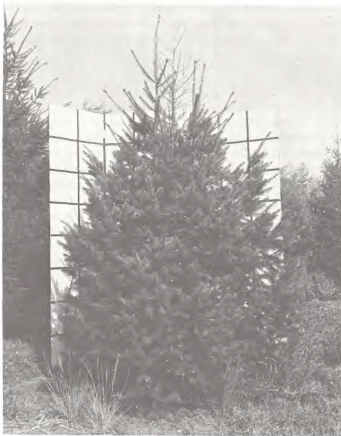
Figure 5.-- A #1647 central Arizona tree showing recovery from terminal dieback of the previous winter.