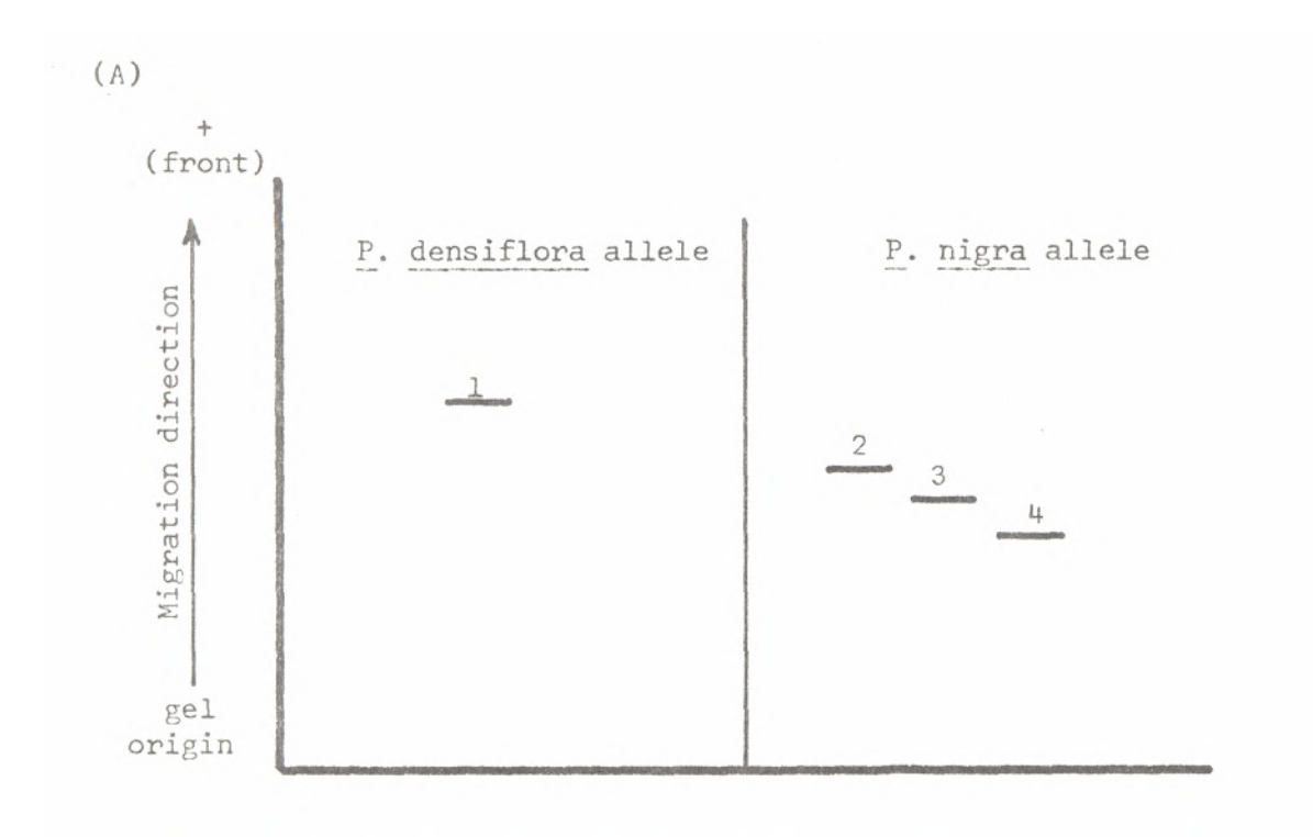
Figure 1. Alcohol dehydrogenase band patterns on starch gels; (A) ADH alleles in <u>Pinus densiflora</u> and <u>P. nigra</u>, (B) ADH forms and their genotypes found in embryos from mixed pollen controlled crosses