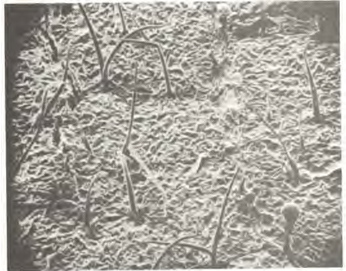
Figure 2. Photomicrograph of lower epidermal surface of black walnut leaf showing trichomes and stomates (X 135).

In late September, 1972, total leaf area was measured with a planimeter, and samples were collected for determinations of stomatal size and distribution and chlorophyll content. Stomatal distribution and size were determined from SEM photomicrographs. A magnification of 135X was used to determine stomatal distribution (Figure 2). The magnification was increased to 680X to study stomatal apertures (Figure 3). Because width of stomatal pores varies greatly during stomatal movement, only lengths were measured to provide an index of stomatal size. Chlorophyll concentrations were determined by the method of Strain and Svec (1966). A single compound leaf was extracted in 80-percent acetone, and chlorophyll a and b levels were determined with a colorimeter at wavelengths of 649 and 665 nm, respectively.