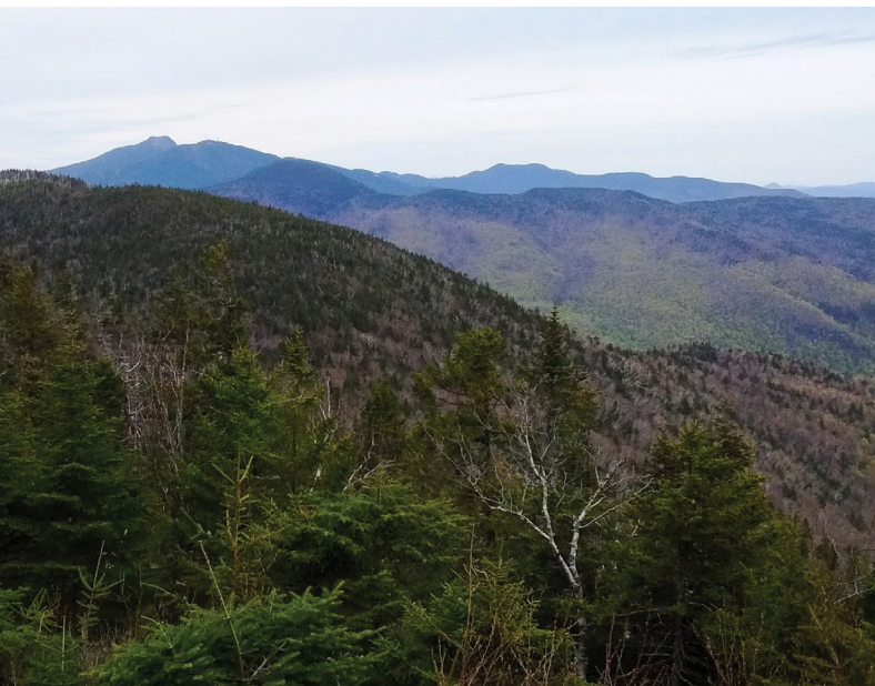
Figure 1. This montane red spruce forest in northern Vermont is typical of forest types between 2,500 and 3,500 ft (762 and 1,067 m) in elevation.

Historically, red spruce was probably more widespread throughout both the northern and southern extents of its range and occupied additional areas with warmer climates than its