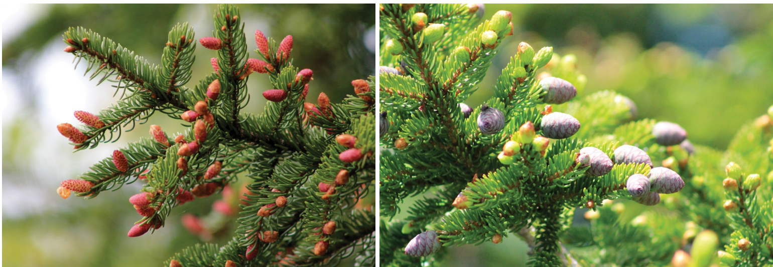
Figure 3. Reproductive structures in red spruce include male (left) and female (right) strobili.

Some of this initial reduction in N_e is attributable to the speciation event with black spruce, in which red spruce is