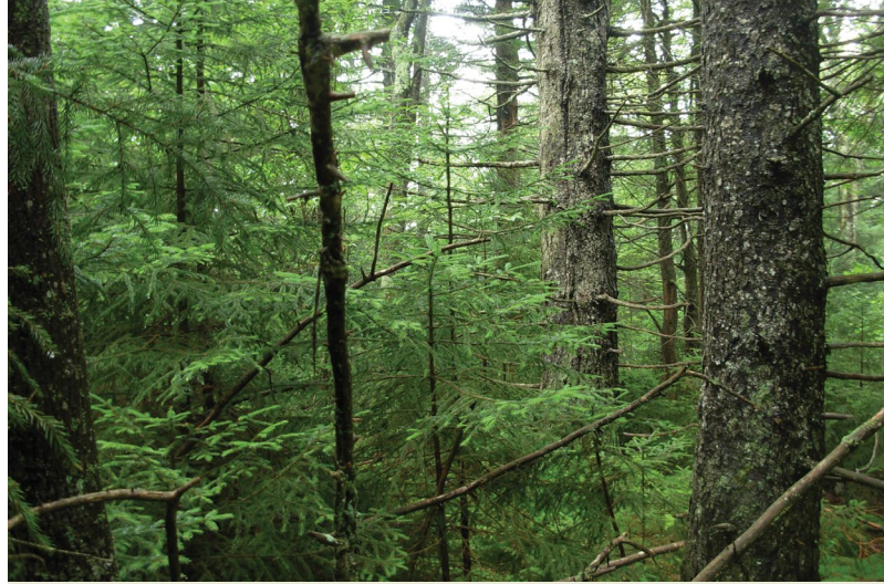
Figure 2. This red spruce forest in Spruce Knob, WV, shows structural diversity and recruitment from the understory. Cool, moist conditions at higher elevations (>4,000 ft [1,219 m]) in the Central Appalachians support the development of mature red spruce communities. Photo by Stephen R. Keller, 2013.

current distribution (Cogbill 2000, Van Gundy et al. 2012). Logging, fire, and atmospheric pollution (acid rain) have severely impacted red spruce and reduced its distribution and abundance, particular in lower elevation northern hardwood forests (Foster and D’Amato 2015, Koo et al. 2015, Siccama et al. 1982). In recent years, red spruce has been rebounding in growth and seedling recruitment at lower elevations, including recolonizing downslope in montane forests, suggesting a slow recovery from the legacies of land use and pollution (Foster and D’Amato 2015, Kosiba et al. 2018, Verrico et al. 2020, Wason et al. 2017).