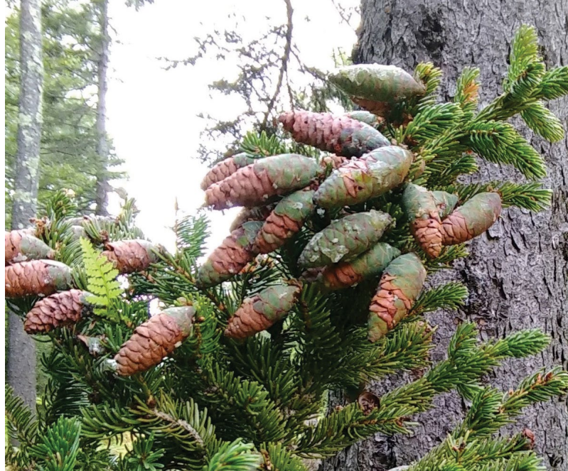
Figure 6. These red spruce cones in northern Vermont show damage incurred by spruce cone worm ( Dioryctria reniculelloides ). Note the small entrance holes visible on the cones and the brown discoloration indicating seed predation.

Red spruce is the target of a few pests but none that have achieved high levels of impact across broad landscapes. Perhaps the most damaging insect pest is the spruce budworm ( Choristoneura fumiferana Clemens), a native insect that damages buds and current-year shoots of red spruce, especially when growing sympatrically with balsam fir. An important seed pest in some areas is the spruce coneworm ( Dioryctria reniculelloides Mutuura & Munroe), whose larvae tunnel into developing seed cones and consume the seeds; this can sometimes have considerable local impact on the seed crop (figure 6). In some areas, yellowheaded spruce sawfly ( Pikonema alaskensis Rohwer) larvae will feed on new needle growth and cause high impacts locally. The eastern spruce gall adelgid ( Adelges abietis L.) is an introduced pest from Europe that primarily attacks Norway spruce but is occasional on red spruce, with its nymphs feeding at the base of current-year twigs and creating pineapple-shaped galls. The parasitic plant eastern dwarf mistletoe ( Arceuthobium pusillum Peck) primarily