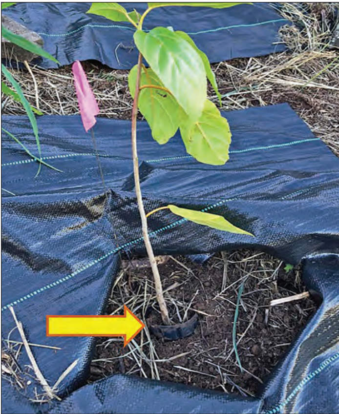
Figure 2. The motivation for developing the SheetPot originated following the observation that a volunteer erroneously planted a seedling with the plastic pot. Thus, the original idea was that seedling pots could be planted directly into the ground to lessen planting shock.

volunteer who planted a seedling with its plastic pot (figure 2). Perhaps this person was frustrated by being unable to remove the seedling and decided to plant it with the pot. Regardless, this incident made us realize that a major stress to the seedlings could be avoided if the seedlings were planted with their pot. A quick search into this option revealed numerous options, including the use of paper pots. We used existing concepts like the Zipset™ Plant Bands (Stuewe and Sons, Inc., Tangent, OR) and developed several designs using a diversity of paper materials with natural and plastic coatings (figure 3). We also used rolls of newspaper in a custom-made tray. Paper pots were very affordable and reduced planting shock considerably but were problematic because the paper material decomposed in a few weeks (figure 4). The use of different coating materials on the paper lengthened the longevity of the pots, but water eventually eroded the paper, causing the medium to break apart and expose the roots. An additional problem was that paper pots cannot be placed side by side as they stick to each other. We developed a tray to keep the paper