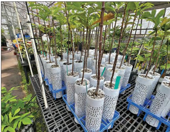
Figure 8. The SheetPot has proven to be a successful design for production of high-quality seedlings in a low-cost pot and is available open-source for wide use.

using thinner and shorter sheets can reduce the cost proportionally. We have tested sheets as thin as 0.1 mm and found they performed just as well while reducing cost and shipping volume fivefold. The sheets can be modified to varying heights by cutting the sheet or using custom, affordable die cuts. The only constraint is the pot diameter which was set to fit a custom-made tray. We chose a 4-in (10-cm) diameter to match the size of the drill bit of the popular BT 45 earth auger (STIHL Inc., Virginia Beach, VA). Seedlings produced in our pot can be put directly into these holes without any additional soil and with minimal stress to the roots. The sheet can be designed in other diameters, provided a holding tray is available. We recommend elevating the trays to ensure air pruning at the bottom and to avoid spiraling roots. Further improvement may include a different locking mechanism or no locking mechanism at all.