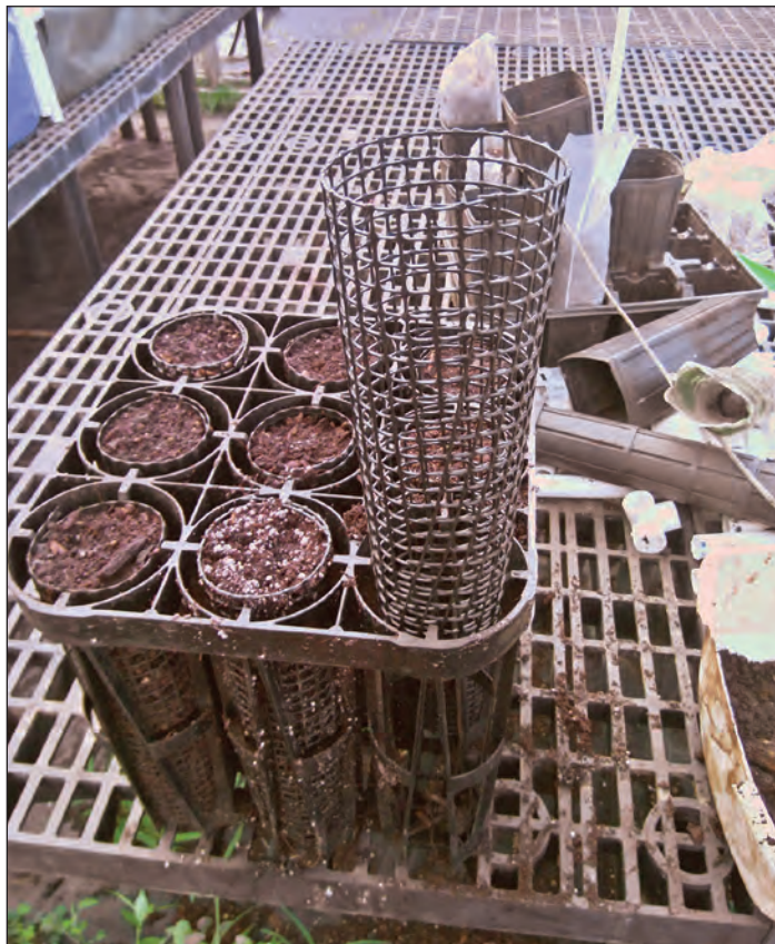
Figure 5. A pot prototype based on chicken fencing was tested to determine its feasibility as an easy-to-use and low-cost container.

After trials with the net pot, we knew that we did not need a bottom for the pots and that the rolled materials