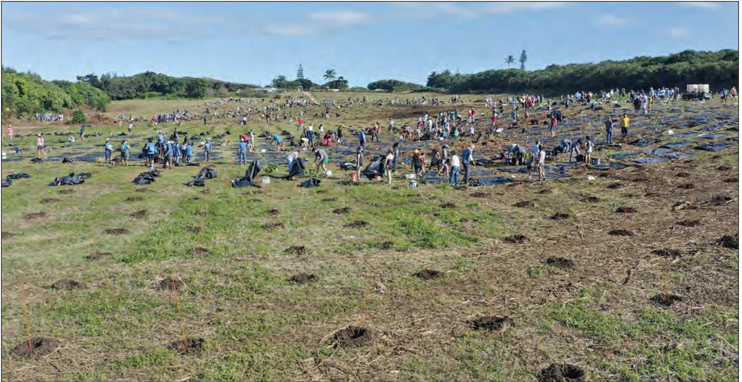
Figure 1. During a large-scale planting operation in November 2021, more than 2,000 volunteers planted 10,000 tree seedlings in 2 hours on the Gunstock Ranch in Hawaii.

2,000 volunteers in 2 hours (figure 1). The project's goals are twofold: first, educate people about how individual emissions add up to create the big problem known as climate change, thereby encouraging people to reduce their carbon footprint; and second, secure the workforce to plant trees at scale. Beyond outreach and education, civic engagement toward the goal of mass tree planting is not trivial. Assuming an average density of 1,000 trees per hectare suggests the need to plant 1 trillion trees in the estimated 1 billion hectares of land available on Earth. Such a mammoth task will require each of the 8 billion humans on the planet to plant about 120 trees during their lifetime, which is a much more manageable undertaking.