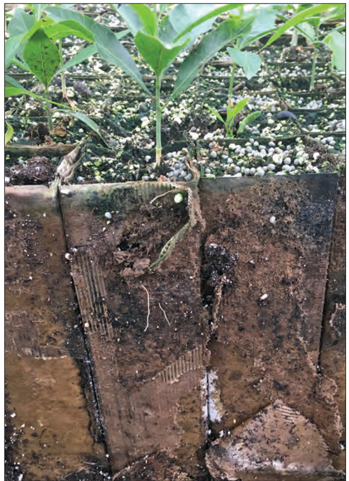
Figure 4. During evaluation of paper pots, the problem was noted that the pots stick to each other upon contact.

pots separated and expected it could increase the pots' longevity, but it did not. We noted, however, that with certain fibrous substrates, there was no need for the pots to have a bottom.