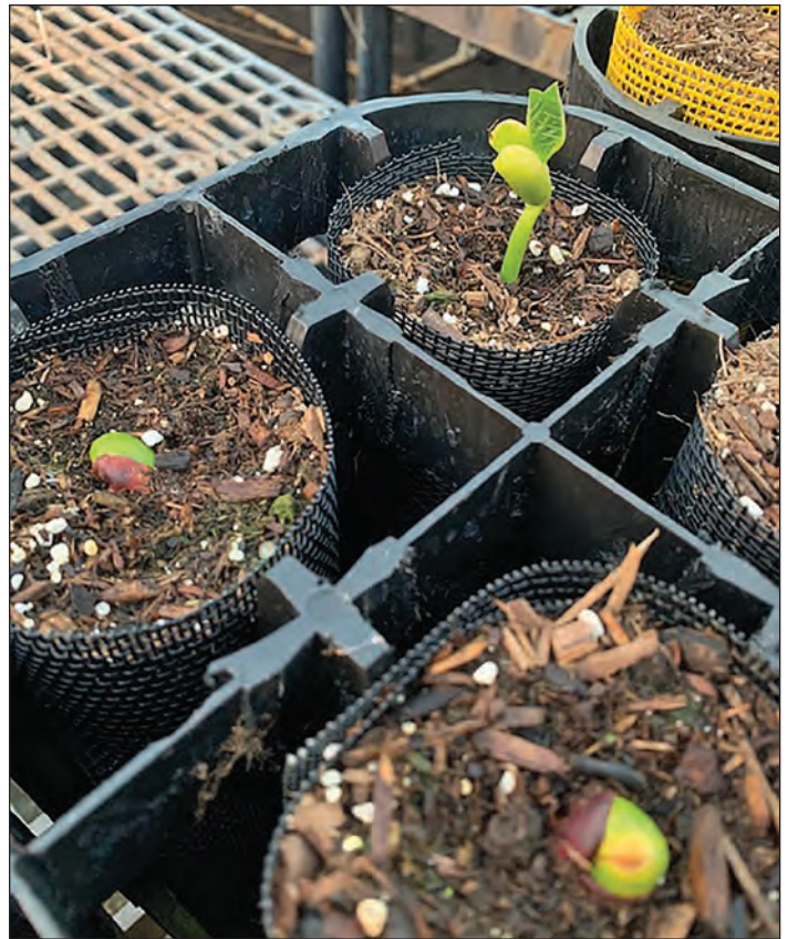
Figure 6. The pot system based on chicken fencing (figure 5) was redesigned using mosquito net during the process to develop a low-cost container for production of high-quality seedlings.

(paper or mesh) could be used to hold the growing medium. But, we still needed to overcome the need for a bulky tray and for being able to easily reuse the pots. What was needed was a rigid material, such that the pot could maintain its shape and only require a smaller tray. The idea eventually emerged for a plastic sheet with locking tabs that hold the sheet in a rolled position, thereby only necessitating a relatively small tray (figure 7). The sheets can be perforated with holes in any configuration to control the speed at which soil dries, avoid waterlogging, and allow for oxygenation. We used 0.3-in (0.8-cm) diameter holes spaced 0.5 in (1.3 cm) apart. Each row of holes is offset by 0.25 in (0.64 cm) (figure 8). We found that this spacing and configuration provided enough aeration to facilitate air-pruning of the roots. During irrigation, each drop of water rolling down the pot's wall has 15 chances to intersect a hole and thus increase irrigation efficiency.