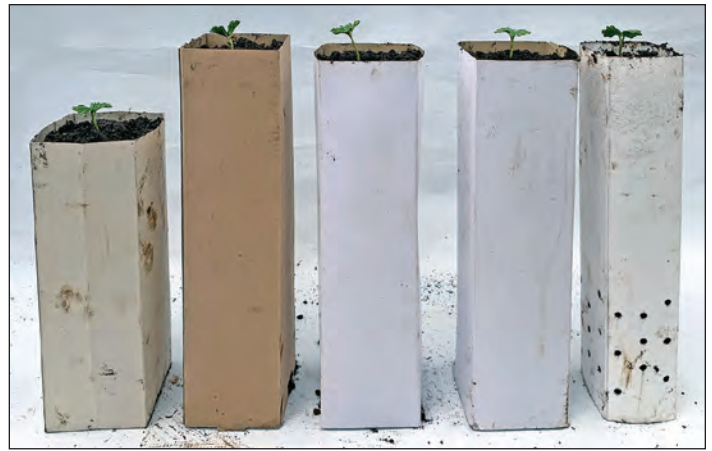
Figure 3. Different types of paper pots were tested to determine their feasibility as a low-cost container for producing quality seedlings on a large scale.

volunteer who planted a seedling with its plastic pot (figure 2). Perhaps this person was frustrated by being unable to remove the seedling and decided to plant it with the pot. Regardless, this incident made us realize that a major stress to the seedlings could be avoided if the seedlings were planted with their pot. A quick search into this option revealed numerous options, including the use of paper pots. We used existing concepts like the Zipset™ Plant Bands (Stuewe and Sons, Inc., Tangent, OR) and developed several designs using a diversity of paper materials with natural and plastic coatings (figure 3). We also used rolls of newspaper in a custom-made tray. Paper pots were very affordable and reduced planting shock considerably but were problematic because the paper material decomposed in a few weeks (figure 4). The use of different coating materials on the paper lengthened the longevity of the pots, but water eventually eroded the paper, causing the medium to break apart and expose the roots. An additional problem was that paper pots cannot be placed side by side as they stick to each other. We developed a tray to keep the paper