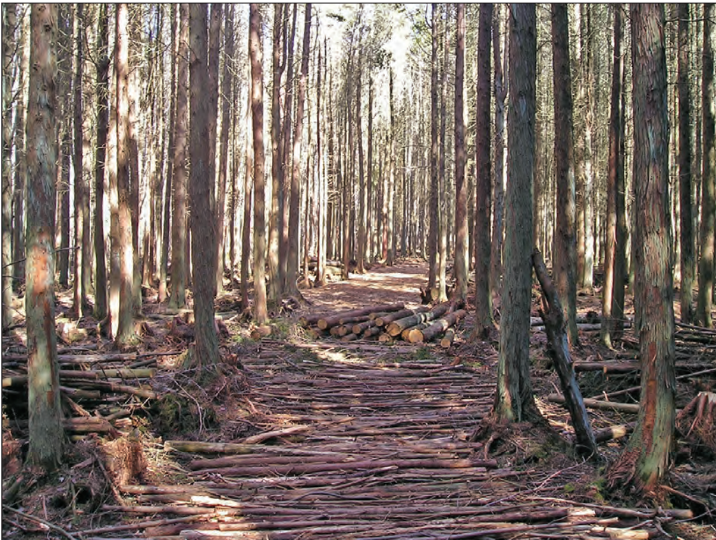
Figure 1. Atlantic white-cedar (AWC) occurs in a patchy distribution in fresh-water wetlands within a narrow coastal belt from southern Maine to northern Florida and west to southern Mississippi. (a) Historical records indicate maximum potential height and diameter of 120 ft (37 m) and 60 in (152 cm), respectively. In present-day stands on good sites, typical heights are 70 to 80 ft (21 to 24 m) and maximum diameters are 24 to 26 in (60 to 66 cm). (b) Mature AWC stands tend to maintain high stem density and basal area. (c) AWC is an early succession species that usually occurs in dense stands such as this small pole stand in Gloucester County, NJ that was thinned from 230 to 190 ft 2 basal area per acre (53 to 44 m 2 per hectare).