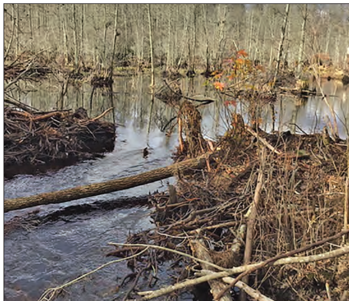
Figure 6. Beavers can kill stands of Atlantic white-cedar. This site is in Atlantic County, New Jersey near the Great Egg Harbor River was flooded due to the beaver dam (foreground). Land managers should monitor beaver activity to avoid excessive losses of valuable timber from prolonged flooding.

AWC stands often experience shallow flooding (fresh water) during the winter months when trees are dormant and evapotranspiration is low. Water regimes can fluctuate widely during the growing season, including