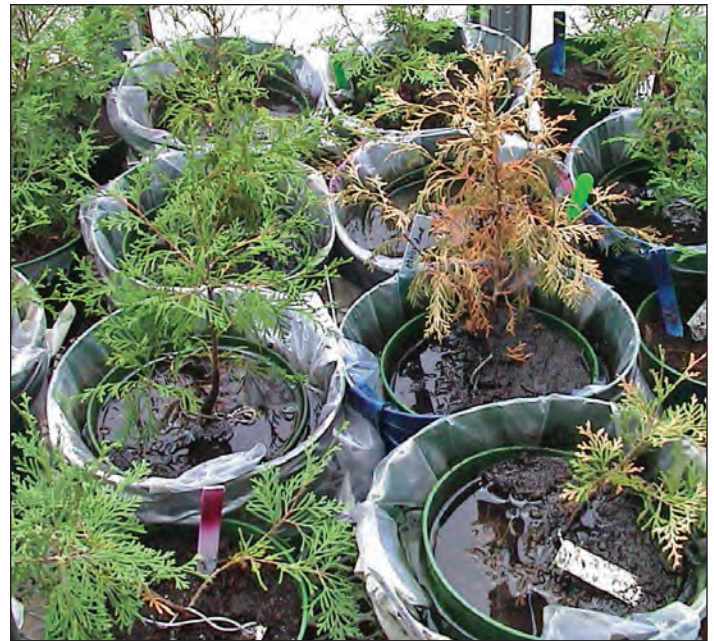
Figure 8. Potted Atlantic white-cedar seedlings were subjected to various levels of salinity (0 to 0.4 percent) and two flooding regimes (flooded or not flooded). Pots designated for flooding treatments were placed inside larger pots lined with plastic. The two plants in the center of the image (second row) were flooded and the one on the right has died from higher salinity.

sea level rises as projected. In addition, hurricanes pose an ongoing threat of blowdown and/or flooding (Lang et al. 2011, McCoy and Keeland 2009, Ury 2021). Potential impacts are likely to become more extreme as sea level rises. Future AWC restoration plantings should be established on suitable sites farther inland at elevations high enough to allow sufficient time for stands to complete one or more life cycles without the risk of salt water inundation.