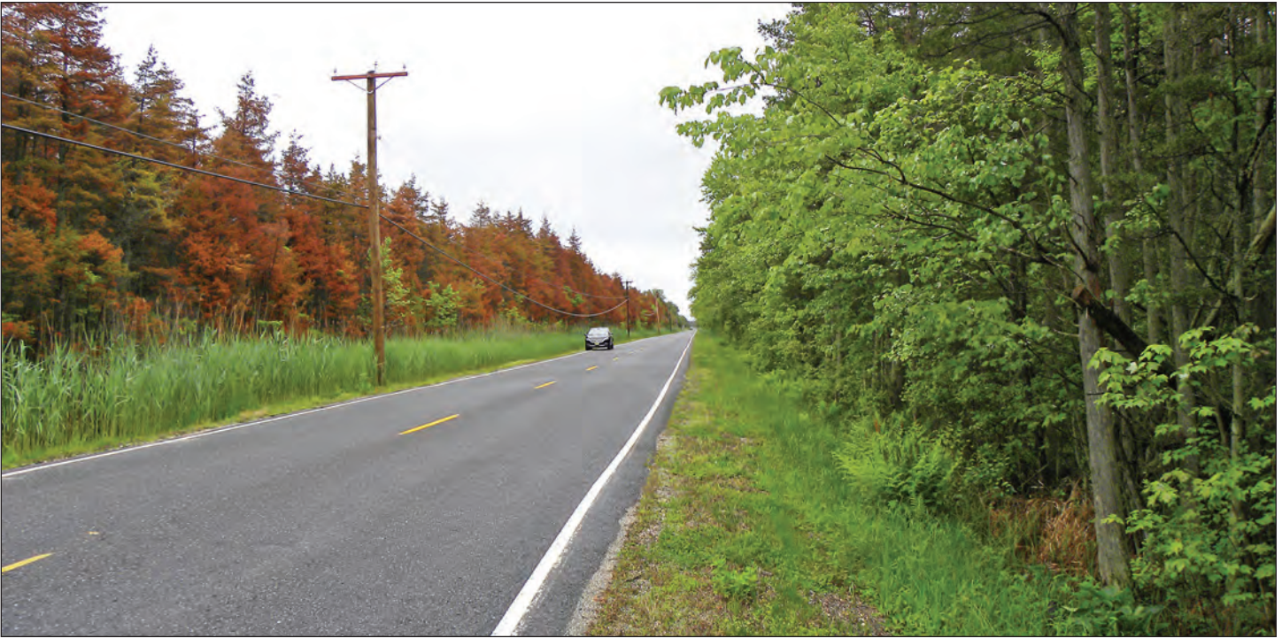
Figure 5. Atlantic white-cedar near the Mullica River in Atlantic County, New Jersey in January 2013. Dying Atlantic white-cedar on the left side of highway resulted from a surge of brackish water that did not drain back into the Mullica River after Hurricane Sandy (October 2012). In contrast, the storm surge retreated on the right side of the highway.