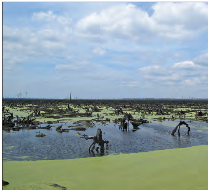
Figure 2. This large tract of peatland in the Great Dismal Swamp National Wildlife Refuge was destroyed by wildfire in the aftermath of a salvage operation to remove residue from 2,000 ac (810 ha) of mature Atlantic white-cedar blown down by Hurricane Isabelle in 2006. Owing to a low water table, the fire burned deep into the peat and killed the dense natural regeneration of AWC already on the site. The fires also eliminated the remaining seed bank from the previous AWC stand. The resulting landscape is mostly open water unsuitable for forest vegetation, probably for hundreds of years.

but also in many previously freshwater marshes farther inland. Dead stands of AWC (ghost forests) are becoming a familiar landscape feature of the New Jersey Pinelands. In coastal Dare County (North Carolina), satellite imagery indicates that 11 percent of the forests in Alligator River National Wildlife Refuge have transitioned to ghost forests in the last 35 years, with a pronounced peak following flooding by Hurricane Irene in 2011 (Ury et al. 2021). Most remaining AWC stands in eastern North Carolina are in Dare County and will become ghost forests if sea level rises 3.2 ft (1 m) as projected in the 21st century (Bhattachan et al. 2018).