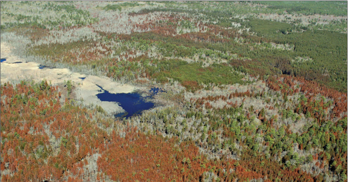
Figure 4. This aerial view (January 2013) shows dead and dying Atlantic white-cedar (red foliage) in southern New Jersey after Hurricane Sandy in October 2012.