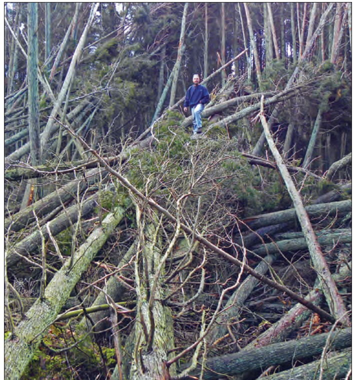
Figure 3. Vast areas of Atlantic white cedar were blown down during Hurricane Sandy in 2012 such as this stand in Burlington County, New Jersey. Most of that timber was not salvaged, thus creating a serious wildfire threat in southeastern New Jersey.

The AWC forest type is also facing a threat from accelerating rates of rising sea level. The New Jersey Meadowlands and other parts of the East Coast have been experiencing submergence and influx of salt water since historical records have been recorded (Zimmermann and Mylecraine 2003) not only in coastal habitats