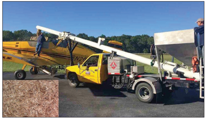
Figure 5. Smooth cordgrass ( Spartina alterniflora Loisel.) seed (lower left corner) being loaded for aerial seeding at Prime Hook National Wildlife Refuge.