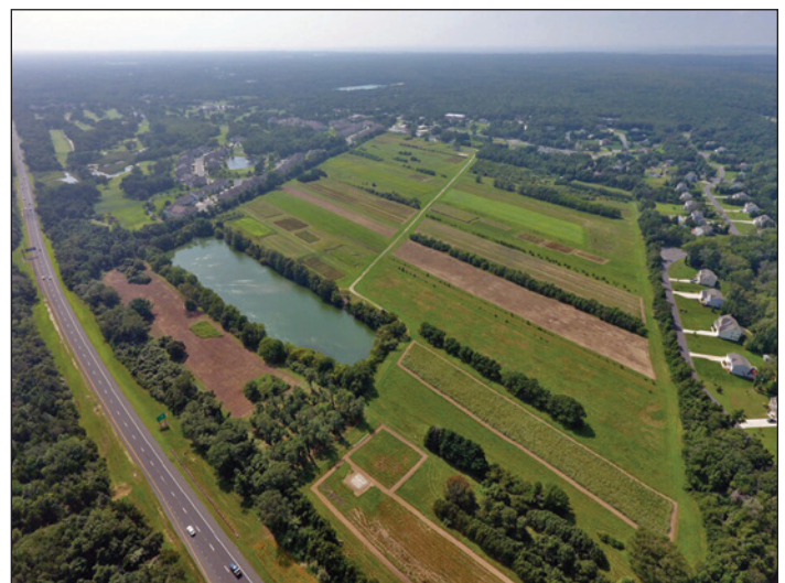
Figure 2. An aerial view of the NJPMC facility located in Swainton, NJ.

The NJPMC is located in Swainton, NJ, (figure 2) on approximately 80 ac (approximately 32 ha) of land leased from the State of New Jersey for production and field studies; all infrastructure is situated on 4 ac (1.6 ha) of adjacent federally owned land. The NJPMC is ideally situated to focus on coastal ecosystem conservation concerns given its location near tidal marshes, coastal dune communities, and extensive wetlands. The NJPMC provides plant solutions for natural resource conservation concerns pertaining to coastal shorelines, sand dunes, mined lands, and coastal grassland habitat