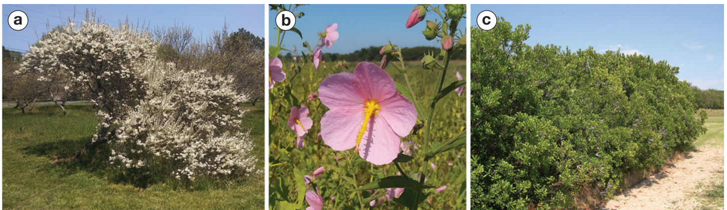
Figure 3. Conservation plants released by the NJPMC include (a) ‘Ocean View’ beach plum, (b) Virginia saltmarsh mallow (in development), and (c) ‘Wildwood’ northern bayberry.