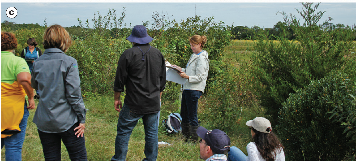
Figure 4. A 2018 NJPMC field day training included (a) native grass seeding considerations, (b) cover crop mix species selection and soil health, and (c) creating pollinator habitat.