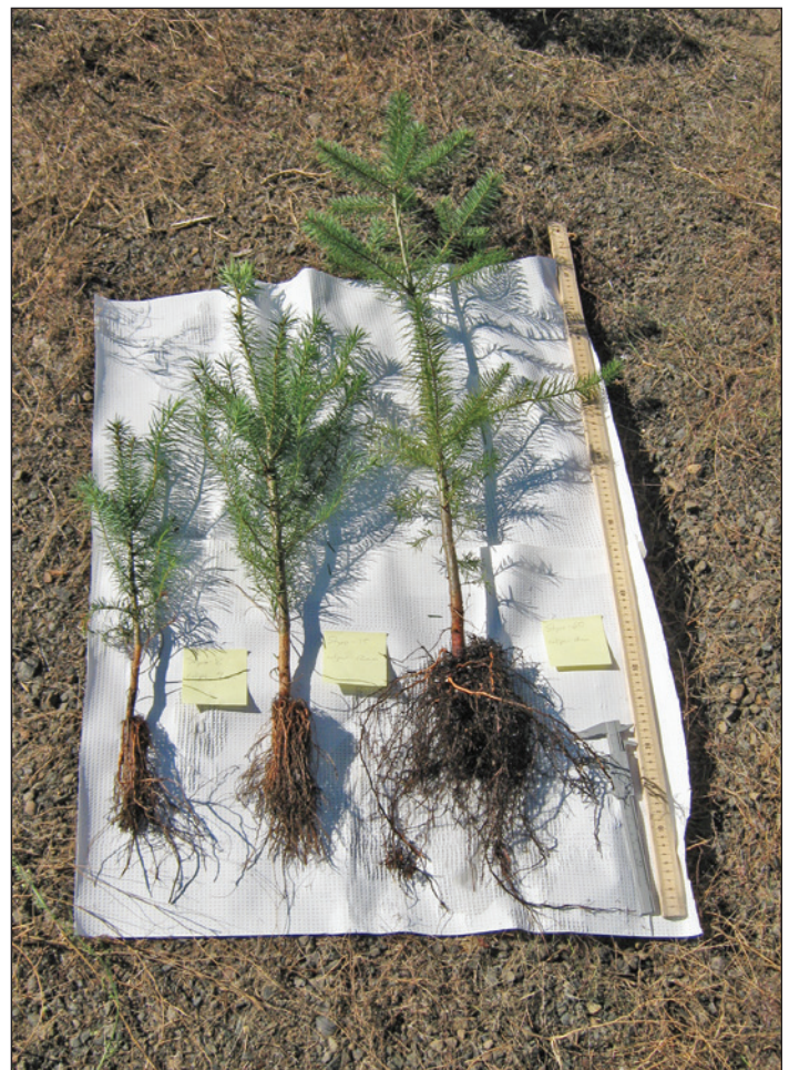
Figure 1. Seedlings for the study were grown in styro-8 (left), styro-15 (middle), and styro-60 (right) containers. The styro-8 and styro-15 seedlings are 1 year old and the styro-60 seedling is 2 years old. For reference, a 1 m ruler is shown on the right.

types, creating 12 experimental units on each site. Three containerized styrobloc™ stock types (Beaver Plastics, Ltd., Alberta, Canada) were included in the study: styro-8 (S-8), styro-15 (S-15), and styro-60 (S-60) with cavity volumes of 130, 250, and 1,000 ml, respectively (figure 1; table 1). Transplanting 1-year-old S-8 seedling for a second season of growth in styro-60 containers produced the S-60 stock type (figure 2). As a result, the S-60 seedlings were 2 years old at the time of planting, whereas the S-8 and S-15 seedlings were 1 year old. All seedlings were grown at the Washington Department of Natural Resources Webster Forest Nursery using a low-elevation improved seed source. The production of S-60 seedlings occurs on a limited basis in forest nurseries, and operational costs for this stock type were five times greater than the cost of growing S-8 seedlings.