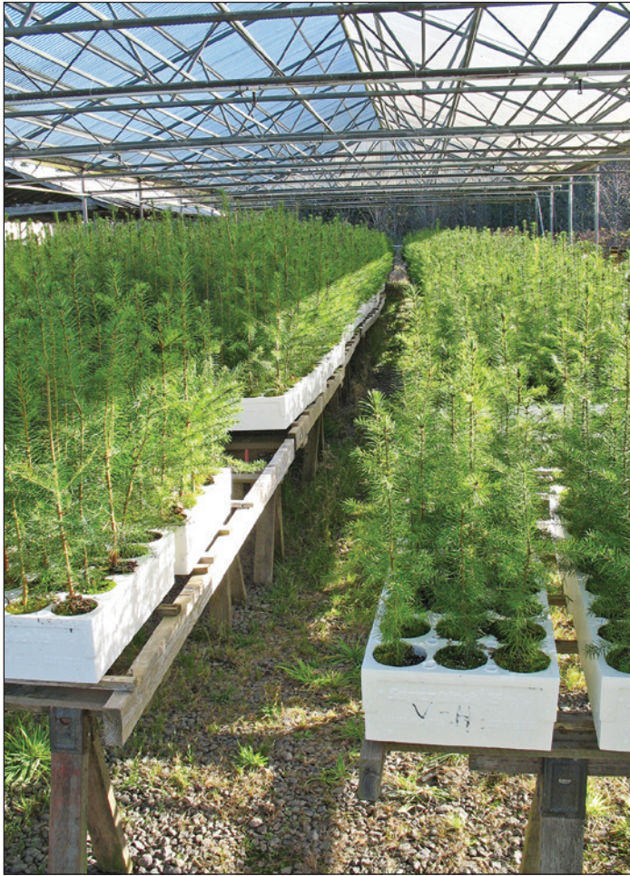
Figure 2. Styro-60 Douglas-fir seedlings growing in the nursery. Each block contains 15 cavities with a volume of 1,000 ml.

Seedlings were planted at both sites in February 2009 at a spacing of 3 by 3 m (10 by 10 ft). Treatment plots were 18 by 18 m (60 by 60 ft) and consisted of 36 measurement trees planted on a grid. All seedlings were protected from ungulate browse with vexar tubing. Chemical vegetation control treatments consisted of a fall site preparation broadcast herbicide application prior to seedling planting (tank mix of 9.5 L/ha [4 qts/ac] glyphosate, 0.3 L/ha [4 oz/ac] Oust Extra, and 0.3 L/ha [4 oz/ac] Induce [surfactant]) and a spring release broadcast herbicide application during the