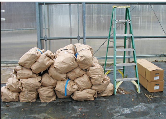
Figure 5. Comparison of the space required for 500 packaged styro-60 seedlings (left of ladder) versus 500 packaged styro-8 seedlings (right of ladder). (Photo by Eric Dinger, 2008)