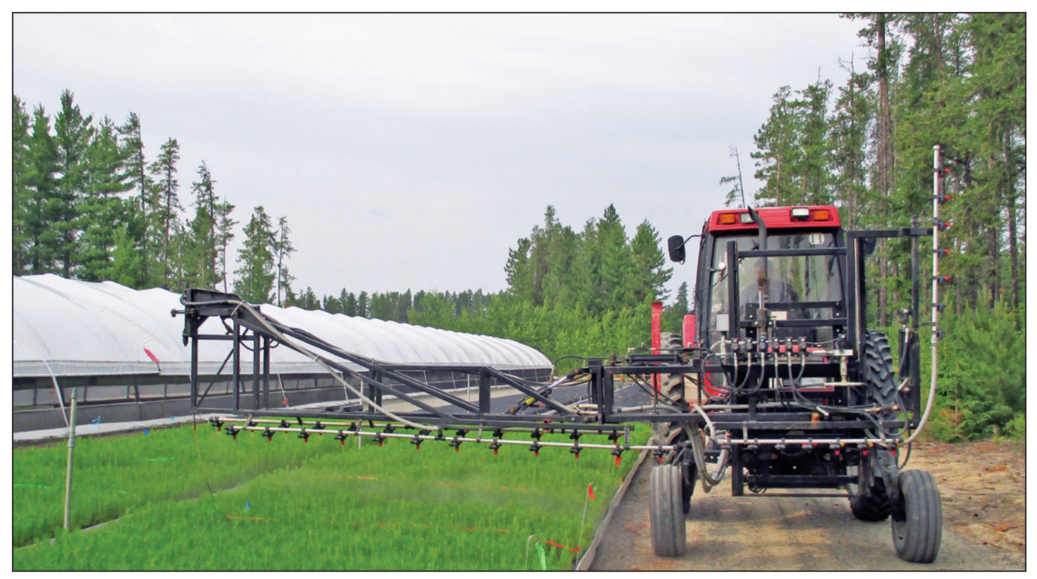
Figure 1. Foliar fertilization treatments with a urea solution were applied using tractor-mounted booms to 2+0 jack pine seedlings grown in 25-310 containers at Normandin nursery.