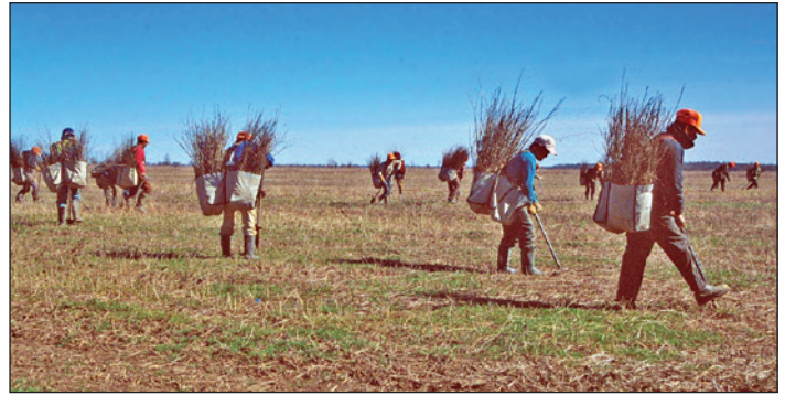
Figure 3. Planting tall, hardwood seedlings in Issaquena County, MS.

Tree-planting costs for hardwoods vary by region, species, and tree size. For some regions in the South, the cost of hand-planting a top-pruned hardwood seedling might be near $0.25 and the retail cost of a seedling might be $0.40. In other places, planting