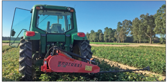
Figure 1. Top pruning Quercus seedlings using a sickle bar mower at the SuperTree Nursery (Shellman, GA). Only a few, well-replicated top-pruning trials have been conducted in operational hardwood seedbeds.

Some nursery managers top prune hardwoods two or three times during the growing season (Rentz 1997, Vanderveer 2005), while others top prune seedlings only once (table 1). The timing for top pruning depends on growing-season length. In some northern locations, the growing season is only 3 to 4 months long, with germination beginning in early May, allowing for top pruning in late summer. For example, at the Griffith State Nursery in Wisconsin, 1-0 northern red oak ( Quercus rubra L.) seedlings are top pruned in