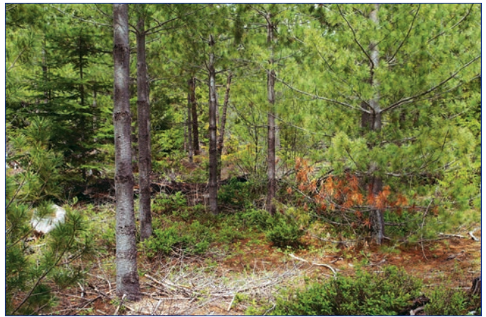
Figure 8. Pruning western white pine can cut blister rust mortality in half.

While planting western white pine from the IETIC breeding program has brought considerable progress in reestablishing this valued species, blister rust must be monitored in white pine plantations (Schnepf and Schwandt 2006). Blister rust has its greatest effect on young trees because they have more green branches close to the ground, where higher humidity increases infection risk. While blister rust-resistant seedlings have a good chance of surviving the fungus, resistance varies considerably by site. Pruning the bottom 10 feet of young trees (figure 8) can reduce blister rust mortality of naturally regenerated western white pine by 50 percent (Schwandt and others 1994). Even blister rust-resistant trees increasingly are being pruned to enhance survival, especially on sites with a high blister rust hazard (e.g., high humidity and Ribes density).