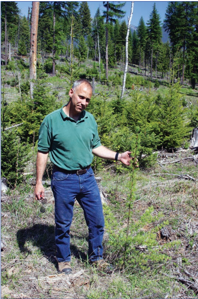
Figure 2. Western larch is commonly planted in northern Idaho because of its root disease tolerance.

ponderosa pine on sites where ponderosa pine or Douglas-fir are climax species; ponderosa pine and western larch on sites where grand fir is the climax species; and progressively more western larch and western white pine, and less ponderosa pine on sites likely to climax in western redcedar or western hemlock. Douglas-fir, lodgepole pine, Engelmann spruce, and western redcedar are occasionally planted, but on most sites, foresters rely on naturally regenerated ingrowth of these and other species.