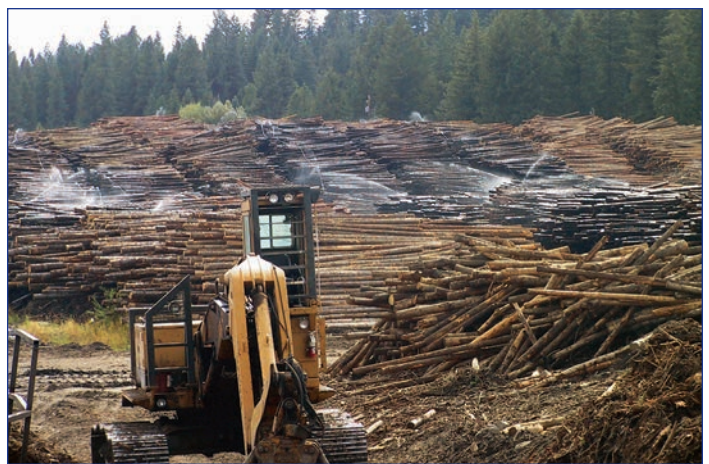
Figure 9. Inland Northwest lumber mills' growing capacity to use smaller diameter logs increases the incentive to plant trees.

With lumber mills' growing capacity to use smaller diameter trees (figure 9), the incentive to plant trees has increased because planting costs are not held as long. Better sites in northern Idaho can produce small diameter saw logs in as little as 25 years. In addition, a great deal of research is underway in the region regarding new uses of forest biomass, both with native species and with hybrid poplars. If these markets develop, they will also provide an opportunity to use trees from precommercial thinning activities, or even plant trees with biomass as the primary end product.