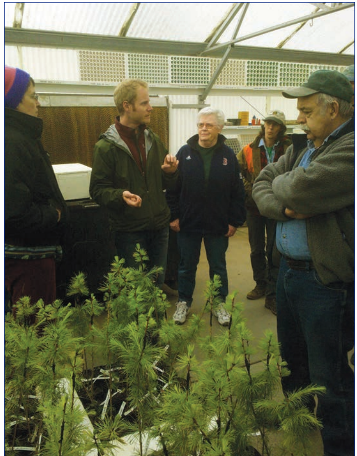
Figure 4. Idaho Master Forest Stewards learning about seedling production at the University of Idaho Center for Seedling and Nursery Research.

Many Idaho soil and water conservation districts, particularly in the northern end of the State, sell tree seedlings for reforestation and conservation plantings. Typically, tree seedlings are grown by contract with private nurseries, then seedlings are sold and distributed through local conservation district offices.