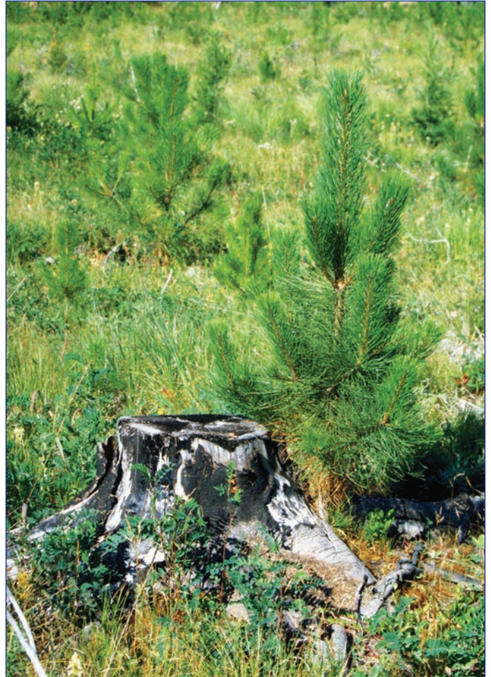
Figure 6. Microsite shade is commonly used to reduce seedling moisture stress in Idaho.