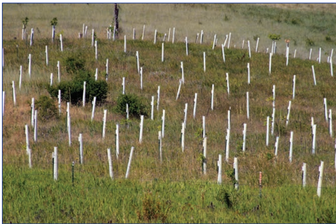
Figure 7. Animal damage protection can be critical in some Idaho reforestation efforts.

White tail deer ( Odocoileus virginianus [Zimmermann 1780]), mule deer ( O. hemionus [Rafinesque 1817]), elk ( Cervus elaphus [Linnaeus 1758]), and moose ( Alces americanus [Clinton 1822]) all frequently browse on Idaho tree seedlings, especially on sites that coincide with winter range for these animals. The most common methods used to help seedlings survive browse damage are rigid plastic mesh tubes (figure 7) and repellents. As trees grow older, individual saplings are occasionally damaged by ungulates rubbing the velvet from their antlers, though sometimes trees survive this activity. Western red-cedar and hardwood species, such as aspen, often cannot be successfully established without protection from ungulates.