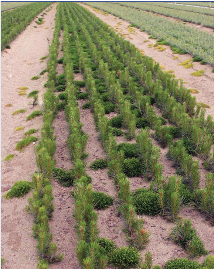
Figure 5. The USDA Forest Service nursery in Coeur d'Alene grows a variety of nursery stock types for planting on publicly owned lands in the region.