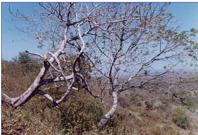
Figure 1. Leafless trees of Bursera graveolens during the dry season.

B. graveolens is common in dry tropical forests from the Yucatan Peninsula of Mexico, south to Peru, and on the Galapagos Islands of Ecuador (Valverde 1998). B. graveolens grows from sea level near the equator up to elevations as high as 5,000 ft (1,500 m), particularly in the Andes of Southern Ecuador and northern Peru (Colter and Maas 1999, Sánchez et al. 2006). B. graveolens grows on rocky, arid, and nutrient poor soils (Clark and Clark 1981, Guerrero and López 1993). In the driest areas that support tropical thorn scrub or very degraded dry forest, B. graveolens is found on a wide variety of soils, and is generalized throughout the landscape. In somewhat moister landscapes, such as dry and very dry tropical forests, B. graveolens occurs on xeric sites such as rocky slopes, ridge tops, and abandoned quarries instead of growing through the landscape (figure 1).