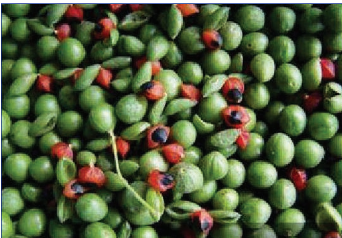
Figure 4. Closed and opened seed capsules of Bursera graveolens . Note the black seed surrounded by a red pulp.

In the Cerro Blanco protected forest and the Guayaquil area, there are 220 species of birds (Berg 1994, Pople and others 1997, Sheets 2004). Some are exclusively frugivorous; many more are partially frugivorous (or omnivorous) like the tyrant-flycatchers (of which 29 species are in Cerro Blanco) or the yellow-rumped Cacique ( Cacicus cela L.) (figure 5). Some are granivores, totally or partially, like the finches, grosbeaks, and the aptly named seedeaters of the genus Sporophila . All these species could be seed dispersers, predators, or both. The primary author was unable to determine which bird species are consumers and which are dispersers of B. graveolens seed.