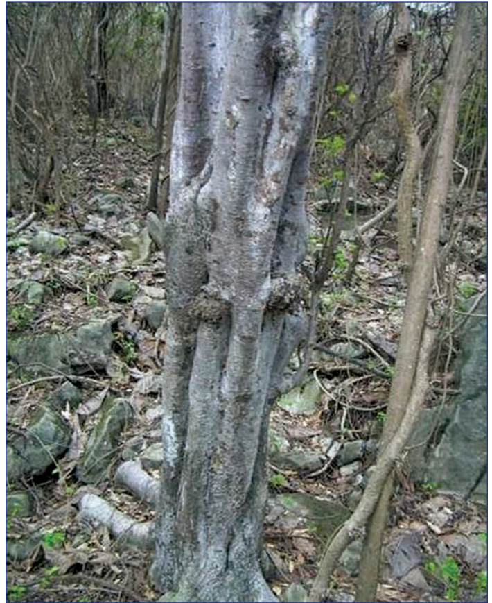
Figure 2. Trunk of Bursera graveolens with resin streaks.

B. graveolens grows to a mature height of 24 to 50 ft (8 to 15 m) and a diameter at breast height of 12 to 24 in (30 to 50 cm). The leaves are compound leaves and the bark is smooth and gray, streaked with white, where resin drips down from cuts or abrasions (figure 2). B. graveolens has tiny, white unisexual flowers (Valverde 1990) (figure 3). Many taxa of the Burseraceae family are dioecious (Daly 1993, Opler and