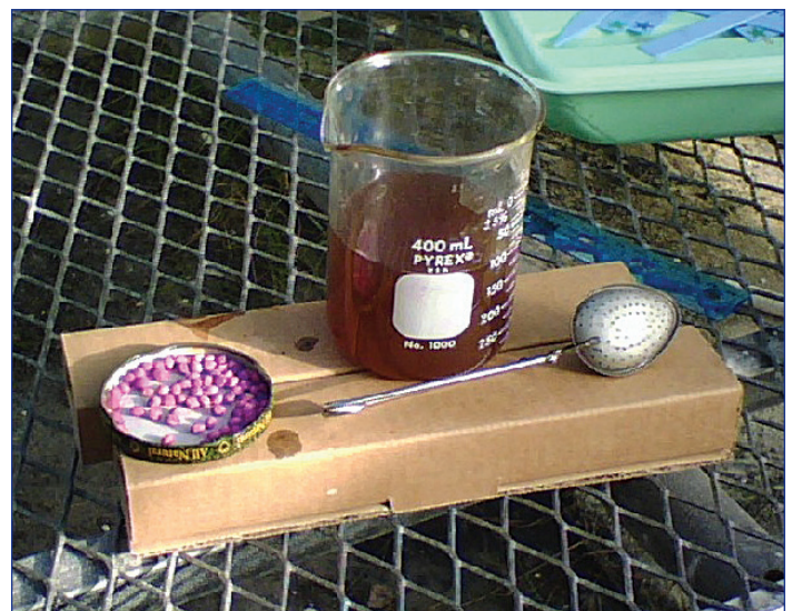
Figure 6. Seeds were subjected to acid scarification treatments by placing them in this spoon-shaped container for loose tea leaves and soaking in 95 percent pure sulfuric acid for 1, 2, 3, 4, or 5 min.

Because of contradictory results of the third trial, a fourth trial was conducted November 1, 2008, through February 1, 2009, using 8 replications of 15 seeds. Seeds were subjected to the same gradient of water temperature treatments as used in the third trial (122 °F [50 °C] to 212 °F [100 °C]). In addition, some seeds were soaked in an acid bath for 1, 2, 3, 4, or 5 min.