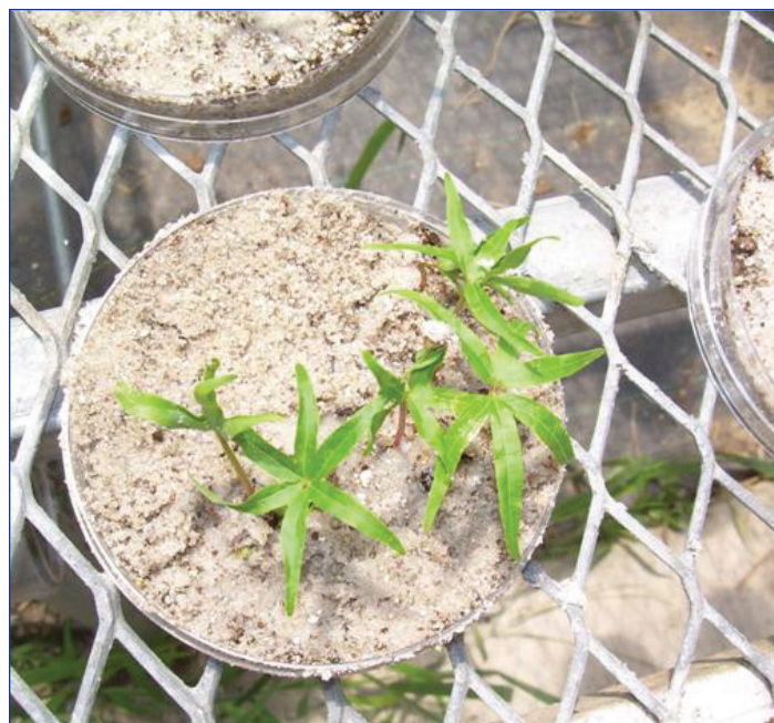
Figure 7. Seeds of Bursera graveolens germinating.