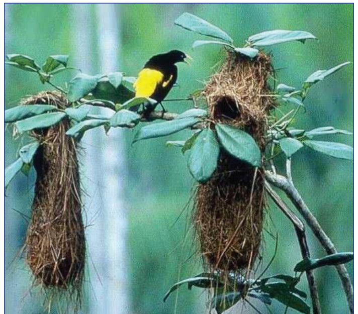
Figure 5. Yellow-rumped Cacique ( Cacicus cela L.), one of many bird species that disperse seeds of Bursera graveolens .