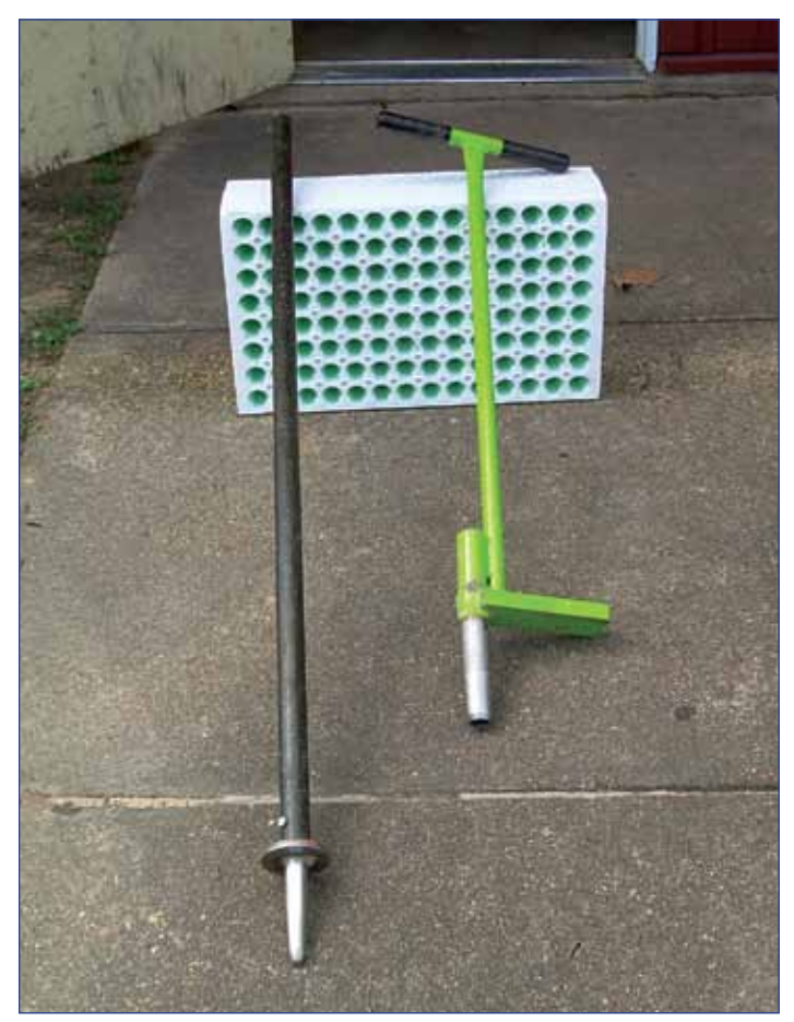
Figure 1. The tool on the left is the solid round dibble with a bit made in the shape of a container cavity, such as those used for growing the seedlings in this study. The tool on the right is a tube dibble that is available commercially from several sources. Both tools are leaning on a Copperblock™ Beaver Plastics Styroblock, model number 112/105, which was the type of container used to grow the longleaf seedlings in this study.

A 10 x 10 m (33 x 33 ft) area was rotary mowed and a fire-exclusion strip was established by tilling around the perimeter. Single-tree plots were established in a completely randomized experimental design. One hundred planting spots were marked with vinyl flags at a 1 x 1 m (3.3 x 3.3 ft) spacing and each was randomly assigned to one of the planting