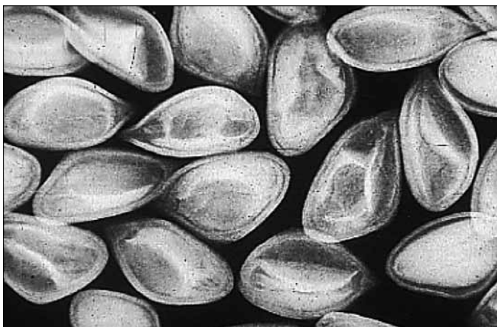
Figure 1. Radiographs of seeds can be a useful tool for the detection of internal seed problems, including infection by pathogenic fungi.

Many factors are related to the establishment of pathogens on and inside seeds and the development of seed diseases. Contamination and infection of seeds by pathogens can occur in all phases of seed production. For many diseases,