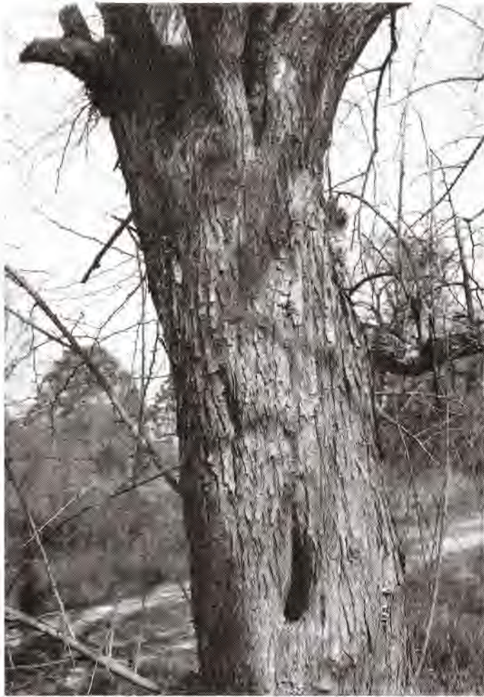
Figure 5—Typical bole of an Osage-orange tree showing crookedness and defects common to the species.

orange seeds and seedlings ended. However, barbed wire still required posts, which the Osage-orange hedges provided.