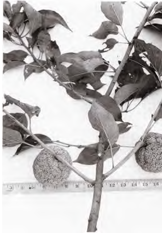
Figure 4—Ripe fruit (scale in inches).

Living fences. As a living fence, Osage-orange was a notable success when well established and properly cared for. Although failures were more frequent than successes, it was still the best option available at the time. Well-informed proponents of hedging had from the beginning emphasized the care needed: site preparation, viable planting stock, proper planting, an artificial fence to protect the young Osage-orange hedge during the first 3 to 4 years, protection from prairie fires, cultivation for 3 years, and trimming every year. Cutting back to 5- to 6-foot (1.5- to 1.8-m) height forced additional branch development at the base of the plant. The long-tough, thorny branches were then interwoven to make an impenetrable wall, and all invading woody plants, principally hackberry ( Celtis spp.), were removed. The width of the hedge usually was maintained at about 4 feet at the base and 2 to 3 feet at the top. Thus trimmed, a hedge excluded livestock but did not obstruct the view of the landscape.