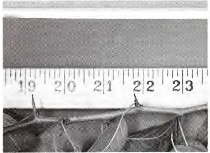
Figure 3—Thorns occur in the leaf axils on fast-growing 1-year-old shoots in full sunlight (scale in inches).

Smooth wire was used as fencing by many farmers, but it was made of iron, which rusted rapidly and was