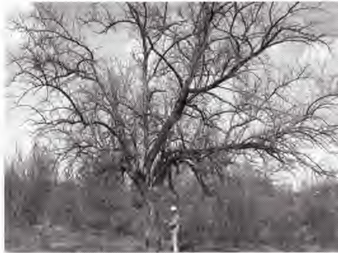
Figure 2—Mature Osage-orange trees typically have short, curved boles and low, widespreading crowns. Even in closed stands on good sites, less than half the stems contain a straight log that is 10 feet (3 m) long, sound, and free of shake. This open-grown tree stood in a pasture near Bastrop, LA, in March 1971.

struct rail fences and temporary dwellings. Immigrants arriving later found no available timber. Unregulated grazing of the public lands by herds of cattle and feral hogs was widespread (Lewis 1941). Any land not enclosed was treated as commons, regardless of the ownership. The fencing problem of the 19th century was general and traumatic; its severity and the depth of feelings it engendered are difficult for late 20th-century Americans to imagine.