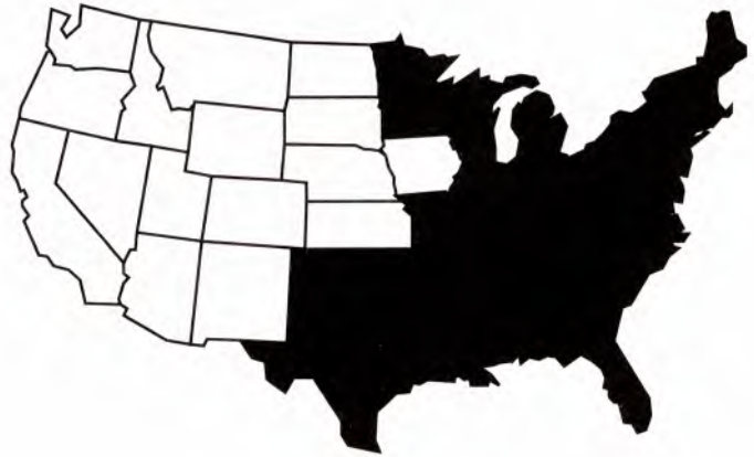
Figure 1—The states in which pales weevil is known to occur are shaded.

Pales weevil is found throughout the eastern and central United States (figure 1), as well as southeastern Canada (Lynch 1984). In general, adult weevils are attracted by the resinous volatiles produced by dead and dying trees (Fox and Hill 1973; Hertel 1970; Peirson 1921; Thomas and Hertel 1969). They then feed and oviposit in the roots, dying stumps, or boles of fallen trees, where broods develop until the onset of winter (Anderson 1980; Doggett and others 1977). Subsequently, overwintering adults emerge the following spring, or brood adults emerge the following spring and summer, and feed on tender bark and cambial tissue of