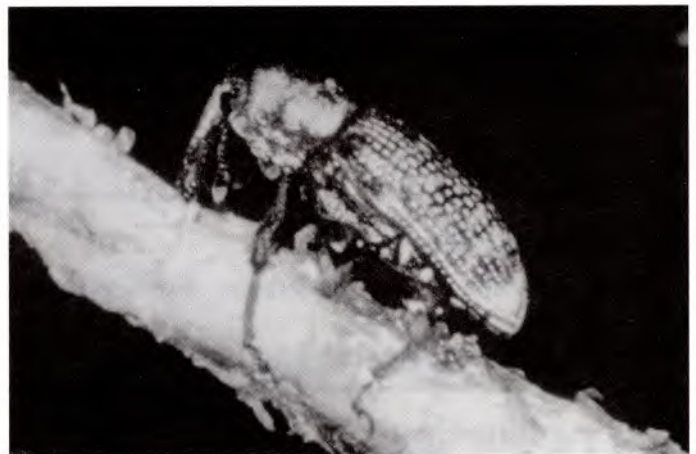
Figure 2—A adult pales weevil feeding on hark tissue of twig.