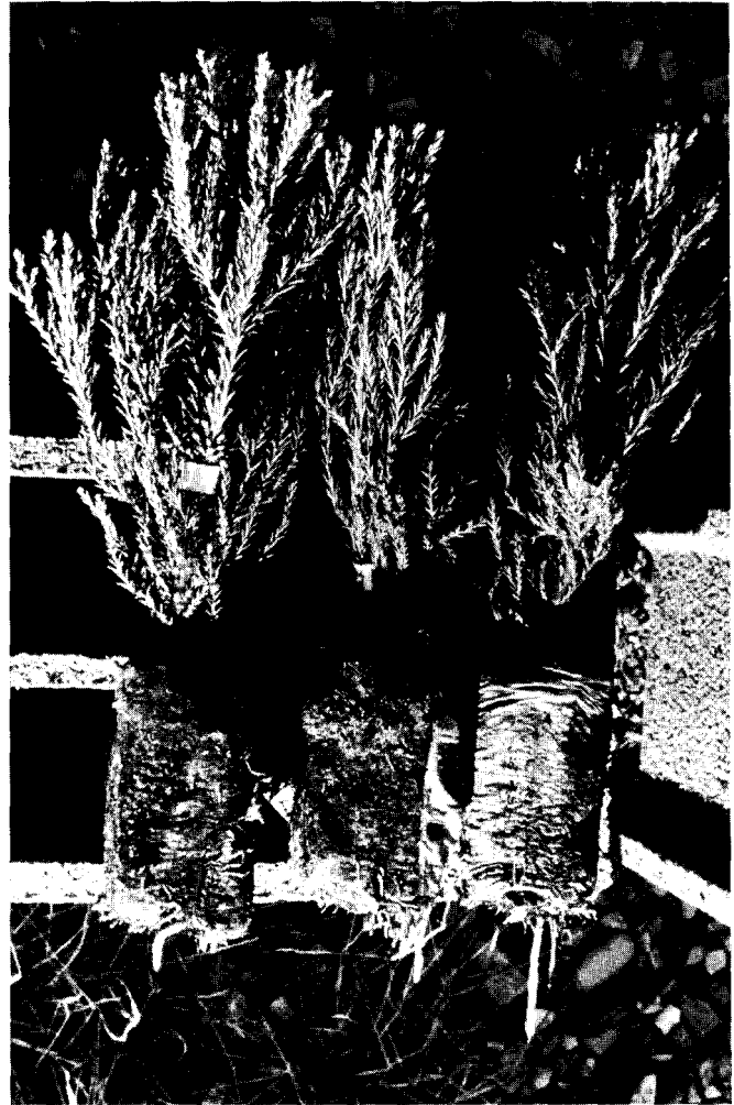
Figure 1 -Seedlings of giant sequoia transplanted into bottomless containers of nonwoven synthetic material (Fertiss) in the greenhouse.

Once transplanted, young seedlings stayed under a tent in the greenhouse. The tent was removed when roots penetrated the nonwoven walls. During this period, water was supplied by subirrigation through a wadded cloth, and protective fungicides at low concentration (2 parts to 1,000 parts water) such as benomyl (Benlate), thiophanate-methyl (Pelt44), dichlofluanide (Euparene), iprodione (Royal), and procymidone (Sumisclex) were applied alternatively once a week. Seedling growing density was reduced from 250/m 2 (25/foot 2 ) to 125/m 2 (12.5/foot 2 ) as soon as first twigs touched each