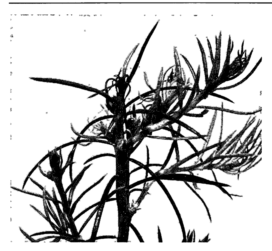
Figure 3—Apical necrosis of a distorted Douglas-fir seedling.

At the Montana nursery, 90% of the trees grown under the nursery's usual regime in medium with dolomitic limestone were stunted (fig. 5). Normal seedlings were significantly taller, but the root collar diameters (calipers) of both normal and symptomatic seedlings were similar (table 3).