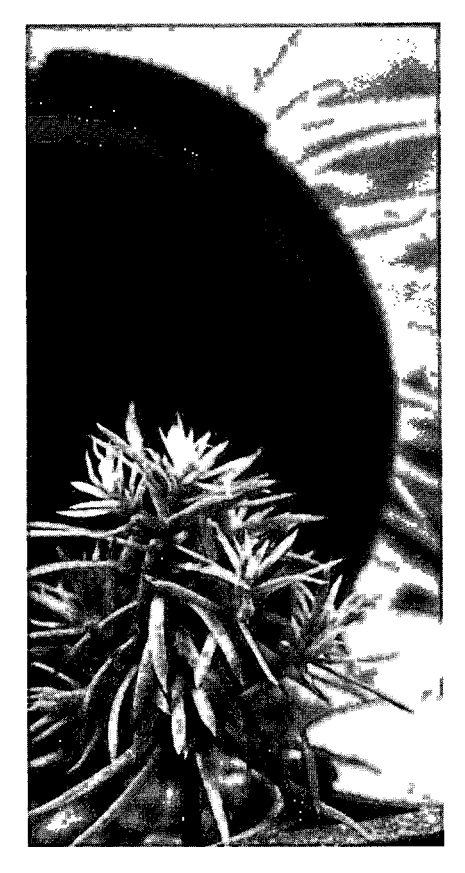
Figure 2 —A 6-month-old Douglas-fir with little internodal extension (circular object is camera lens cover).

Seedling tissue samples were analyzed at 12 weeks after germination to check for mineral nutrient deficiency or toxicity; the results were inconclusive (table 2). Even though irrigation water was acidified, further acidification of the water did not relieve the problem. Finally, late in the season, repeated applications of high rates of ammonium nitrate relieved the problem in some of the affected seedlings, but unfortunately allowed normal seedlings to grow too tall.