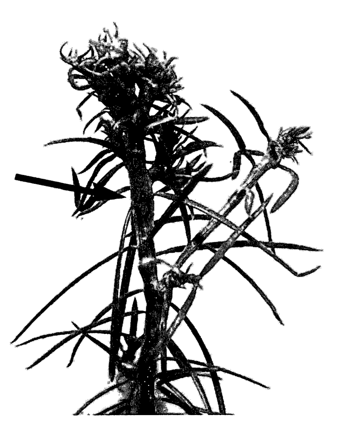
Figure 1 —Douglas-fir seedling with tight curling of needles, resembling herbicide damage. Arrow points to swelling beneath the terminal bud.

very short needles and deformed terminal buds. Some affected seedlings had extremely small internodes, and many 6-month-old seedlings were only 3 to 4 cm tall (fig. 2). The most severely stunted seedlings eventually developed tip necrosis (fig. 3). Some affected seedlings seemed to lose apical dominance as the lateral shoots continued to grow, often resulting in seedlings with multiple tops (fig. 4). The root systems were apparently unaffected, and most distorted seedlings had firm root plugs.