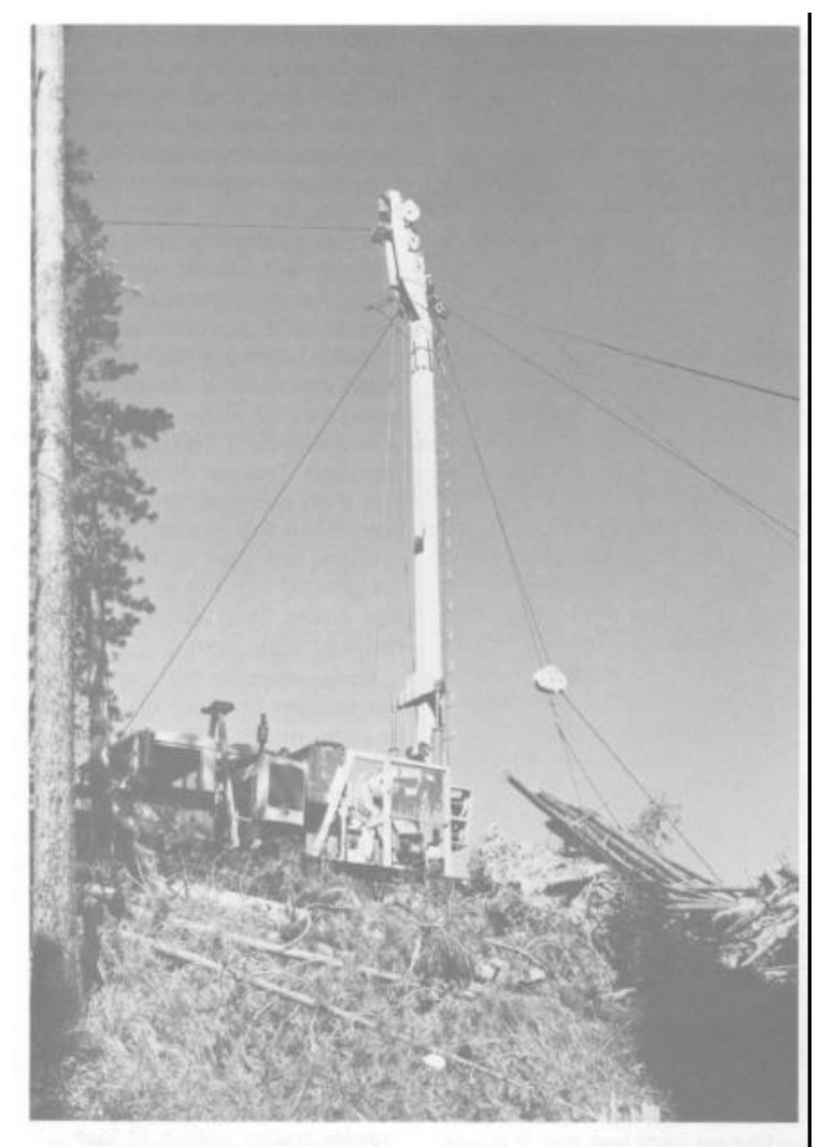
Figure 2—Clearwater Yarder reduces slash loading before operating scarifier implement.