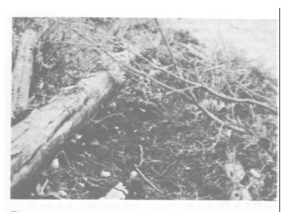
Figure 3—Typical spot dug out by cable scarifier.

Our scarifying implement did not work well in the area. Even five of six passes were not enough to create adequate planting spots. The brush proved too thick and limber. The implement simply skidded over much of the