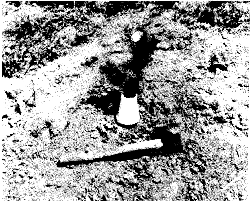
Figure 2—Seedling with Styrofoam cup.

Bareroot 2+0 Douglas-fir seedlings at two sites were shaded in the following ways: a) with shadecards to the south, b) with shadecards to the east, and c) with 187-millimeter ( 6\frac{1}{3} -ounce) Styrofoam coffee cups inverted around seedling bases. Some seedlings were left unshaded for controls. The shades were installed in a randomized, complete-block design (2), with three replications at the two sites.