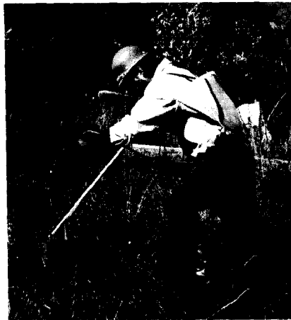
Figure 1 —Worker applying herbicide with the modified Spotgun around a tree protected with an improvised shield.