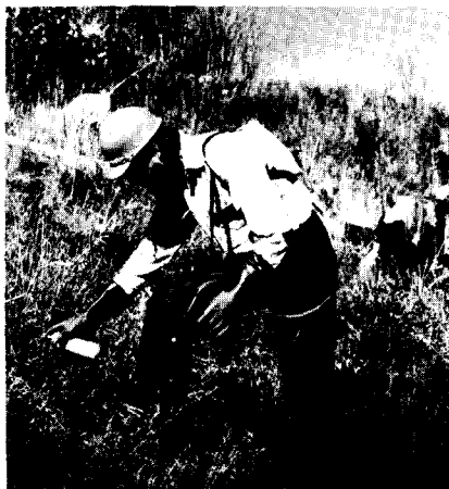
Figure 3 —Worker applying paint spot before applying herbicide with the modified Spotgun.

For spraying in front of or to the side of the operator, the bent delivery tube can be positioned as in figure 2. When it is desirable to spray behind the operator, it is more comfortable to mount the tube so that the bend is in the opposite direction. The bent delivery tube is preferred to the straight tube for these types of application.