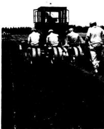
Figure 6. —Two four-row cutting planters in operation—1972.

Plans for the fabrication of this four-row planter, which were donated by Harold Clarke, are available for loan only, on a first-come, first-served basis.