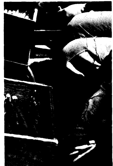
Figure 3. —Feeding cuttings into planting mechanisms—1967.