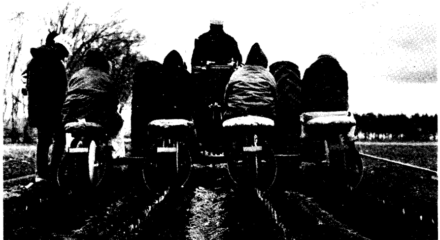
Figure 4. —Four-row hardwood cutting planter— 1966–67.

From 1966 to 1971, the cutting planter's packing wheels were modified to incorporate the techniques just discussed (fig. 5). The original two rubber-tired wheels were replaced by metal wheels in 1966 to increase compaction of soil around the cuttings. However, these packing wheels left a depression into which the herbicide-treated soil moved with irrigation, and weed