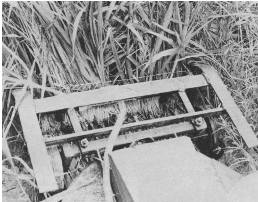
Figure 2. —Close-up of the applicator head showing details of mounting hardware.

harmful. The only apparent damage to trees was from chemical entrance into trunks damaged by the guards.