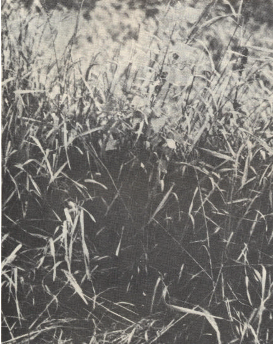
Figure 1. —Planting in areas with reduced internal drainage results in 50 percent or greater reductions in growth and often contributes to heavy mortality.

herbicides were used to combat plant competition.