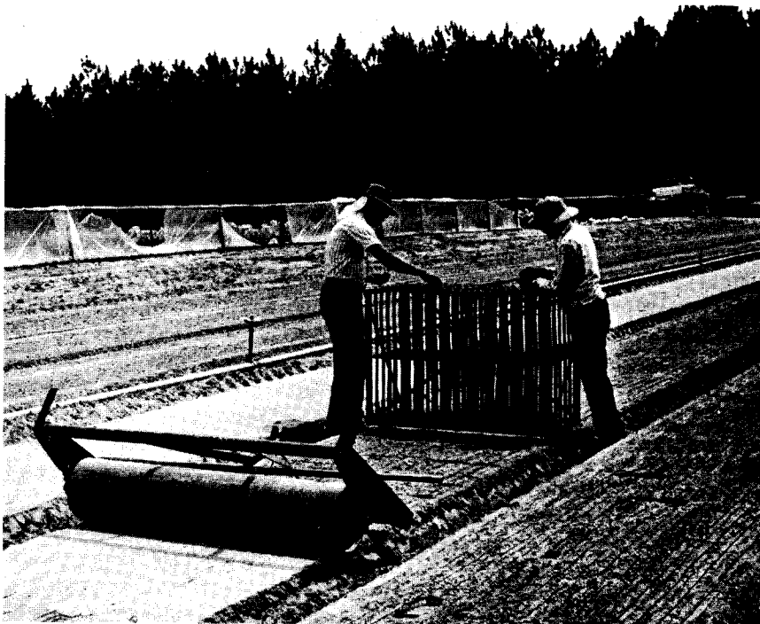
Figure 2. — Planting table in use in a nursery bed.

A roller can be used to pack the seed down directly after the planting of the seed. In general we feel that the planting table speeds up the planting procedure considerably and without doubt reduces fatigue.