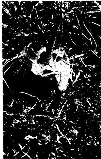
Figure 1. —Improperly planted paperpot seedlings with paper extending above soil surface.

Deformed roots are certainly nothing new on planting stock. The frequency of the "hockey-stick" root system on transplants is a prime example. Also, many seedlings that are jammed into the small slit made by a planting bar frequently develop an abnormal root system. However, anything that can increase survival and growth of plantations, including elimination of poorly developed root systems, should be used. It is important that the potential problems with lack of paper degradation of paperpots be recognized.