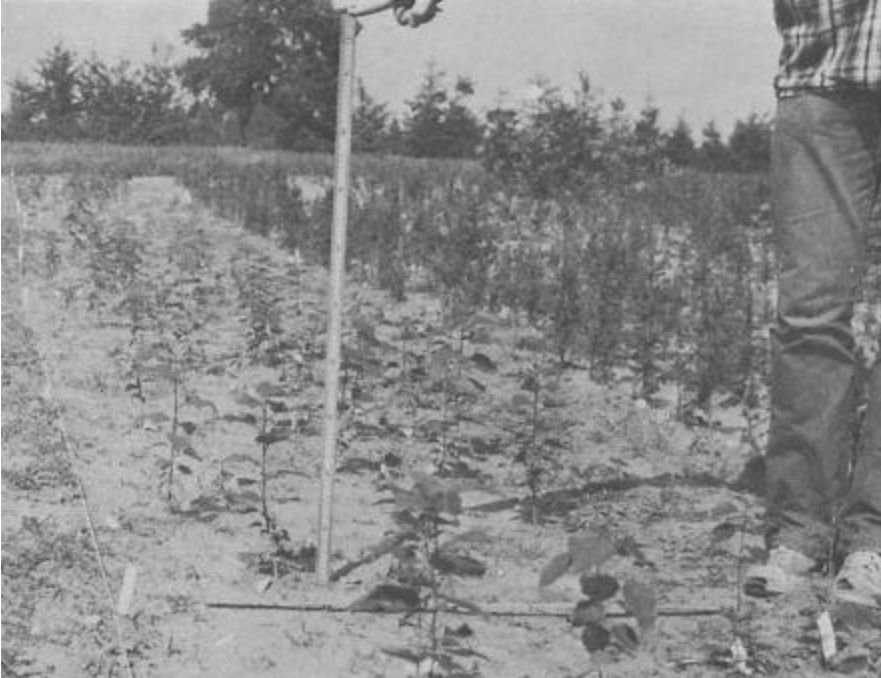
Figure 1. —Block A, September 1975 – One of the blocks planted with barerooted aspen seedlings, toward the end of the first growing season following transplanting. Notice the relatively low survival.

experience with aspen seedlings, however, shows that they can be lifted and stored under similar conditions for up to 10 months without loss of viability. However, it is likely that some of the new lateral roots which developed during the storage period may have been damaged during planting, and hence hampered the survival of the plants.