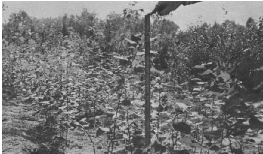
Figure 3. —Block C, September 1975 — A block planted with containerized aspen seedlings, first growing season following transplanting.