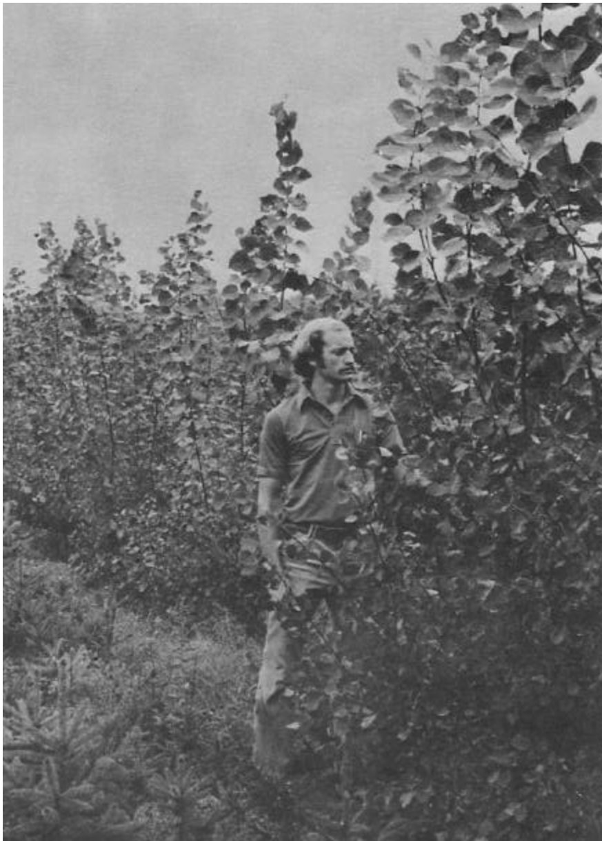
Figure 2. —Block A, September 1977 – Barerooted aspen seedlings after three growing seasons.

The relative growth performances of the different planting stocks in 1975 suggest the transplant shock effect is greater for barerooted aspens than for containerized stock. However, this effect seems to last longer on bigtooth aspen, since barerooted bigtooth aspen plants still grew significantly less than the containerized plants during the second year, unlike trembling aspen. The quicker adjustment of trembling compared with bigtooth aspen barerooted transplants to their new environment might be due in part to their inherent faster