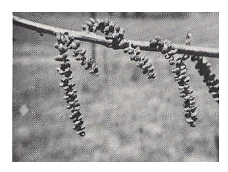
Figure 1.—Staminate catkins of black walnut at anthesis.

Catkins are first visible as axillary buds during late summer. They are borne on the maturing wood grown that summer and have a rough or lumpy surface compared to leaf buds, which have a scale like smooth covering with separations between the scales. In the early spring, catkins begin expansion and become much more prominent. In Indiana, they are approximately one-half inch long by April. Growth continues, and although catkins may reach a length of from 2 to 4 inches, they cannot be forced to shed pollen as long as they remain green in color. Several days before anthesis, the anthers begin to yellow and become "full bodied" in appearance (figure 1).