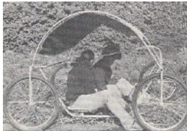
Figure 2. — Cart being used on beds of woody shrubs. Note the freedom of movement and accessibility.

Although actual figures are not available, those using this device feel that in moderate to heavily weed-infested beds this cart enables them to do a better job at a somewhat faster pace than the usual kneeling position allows. Decreased time on lightly weeded areas is questionable.