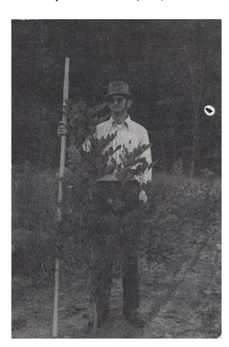
Figure 3.—Trees on the left were planted in tilled ground and cultivated three times during the growing season; those on the right were planted in sod and had no weed control.

CAUTION: Pesticides can be injurious to humans, domestic animals, desirable plants, and fish or other wildlife—if they are not handled or applied properly. Use all pesticides selectively and carefully. Follow recommended practices for the disposal of surplus pesticides and pesticide containers.