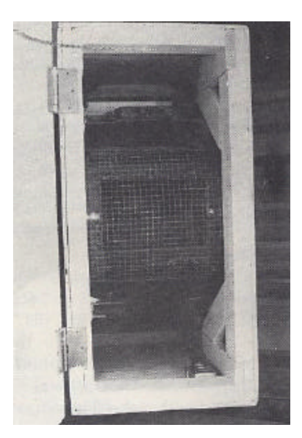
Figure 3.—Top view of seed extractor with lid open to show how inner and outer washer drums were modified to accommodate hardward cloth.

strip of ½ -inch hardware cloth secured with metal screws. A 12by 12-inch square was cut from the top of the outer drum so that cloths of various mesh can be easily interchanged. The plywood top of the extractor was hinged for the same purpose (figure 1).