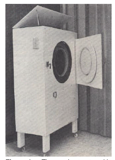
Figure 1.— The seed extractor with hatch and lid open.

Inner and outer drums were slightly modified (figure 3) by cutting out sections as follows: Without disturbing the vanes, six 6 \frac{1}{2} - by 9 \frac{1}{2} -inch sections were cut from the 11 \frac{1}{2} - by 10-inch diameter inner drum. The periphery of the drum was then covered with a 11- by 61-inch