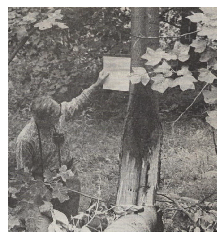
Figure 2.—Major fork destroyed by wind. Note discoloration at union.

Damage was coded and results subjected to an analysis of variance. There was greater damage to trees with the high nitrogen treatment, statistically significant at the .05