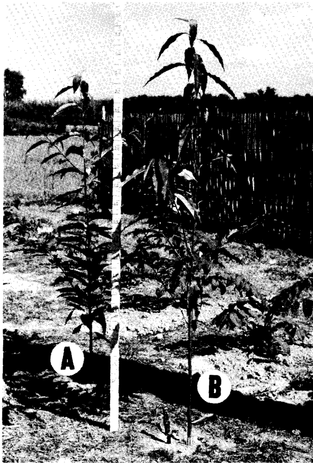
Figure 3.—Black cherry one growing season after container planting on wind protected, open field site: a. Fertil pot with soil, b. Conwed plastic mesh with stack of 6 Jiffy-7 pellets. Nearest tree is 4.5 feet tall. Note control of weeds with paraquat.

The value of container planting was shown by an experiment that compared the field performance of black walnut trees planted as 1-0 bare rooted nursery stock versus direct seeding and 3-week-old container-grown trees (table 5). These results show that after 2 years there was no significant difference in height and diameter growth between the 3-year-old nursery-produced trees and the 2-year-old trees planted by the other methods. Foresters have seldom been satisfied with 1-0 barerooted hardwood seedlings for field planting. Using the container approach, we can achieve better hardwood establishment in a shorter time.