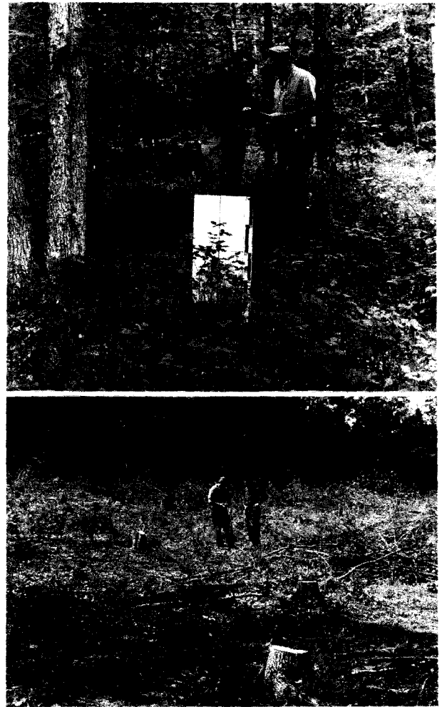
Figure 1.--Nine hybrid poplar cuttings survived and grew well on a clearcut site (lower). The same clones planted on uncut plots showed 98-percent mortality after an extreme drought period (top).

Trends and fluctuations in the soil moisture of the clearcut and uncut test units were re-