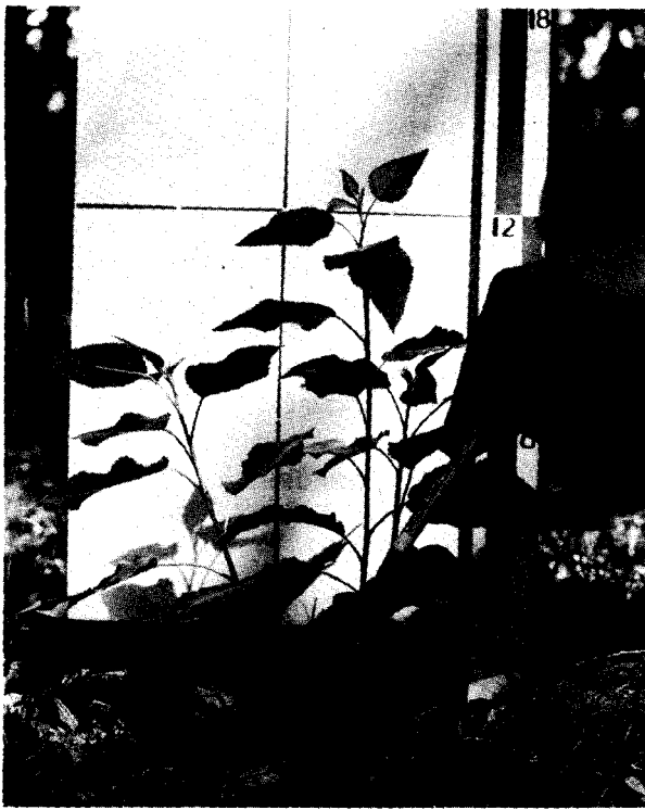
Figure 3.--A vigorously growing hybrid poplar cutting prior to extreme drought conditions on the uncut area.

planting, and by the end of the 1965 growing season, approximately 98 percent of all clones was dead. Thus, the interaction of drought and soil moisture depletion and the physical characteristics of the various clones could be evaluated (fig. 4).