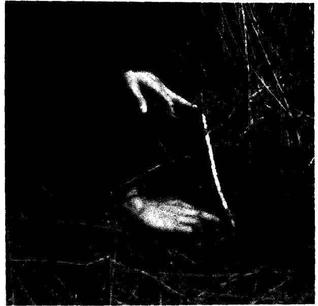
Figure 2.--Typical heavy ground cover heavily infested area showing Pinus virginiana with 12-inch girdle.

To determine the relationship of ground cover density to pine damage, a 2-mile span