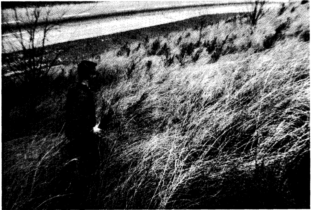
Figure 3.--General view of area heavily damaged by rodents. Serecia lespedeza planted in combination with Pinus virginiana along Interstate 81.

of the circumference of the tree was designated a light girdle. When bark was removed from more than 50% of the circumference of the tree, it was called heavy girdling.