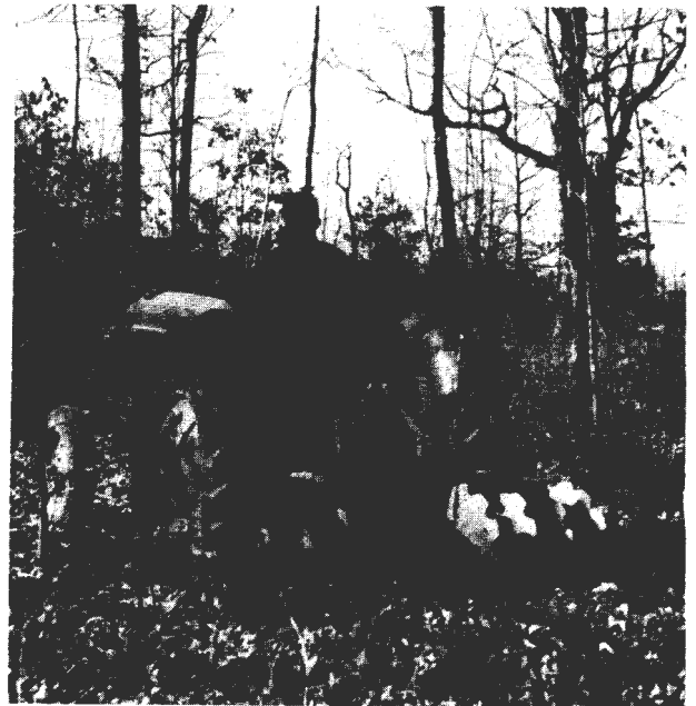
Figure 1.--This light tractor and bush-and-bog-type disk prepared seedbeds suitable for sowing white pine, at the rate of about 1 acre per hour.

In early May, sawtimber and small poles were killed with 2,4,5-T applied with a tree in-