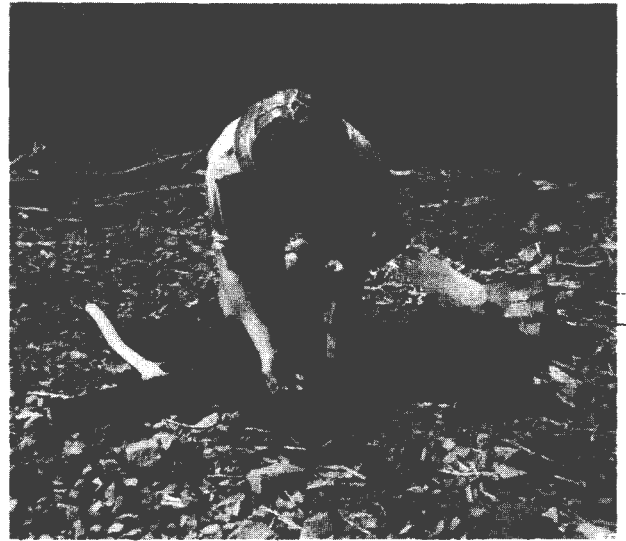
Figure 2.--Planting a tree with fertilizer pellet on the rocky study site.

The average height at planting for seedlings planted with fertilizer was 0.43 feet; for those planted without fertilizer it was 0.45 feet. Trees planted with fertilizer grew consistently faster. Growth differed the most during the first 2 years, and the fertilized trees continued to grow 40 to 50 percent faster during the last 3 years. Analysis of variance reveals that growth differences were significant at the 1-percent level in all 5 years.