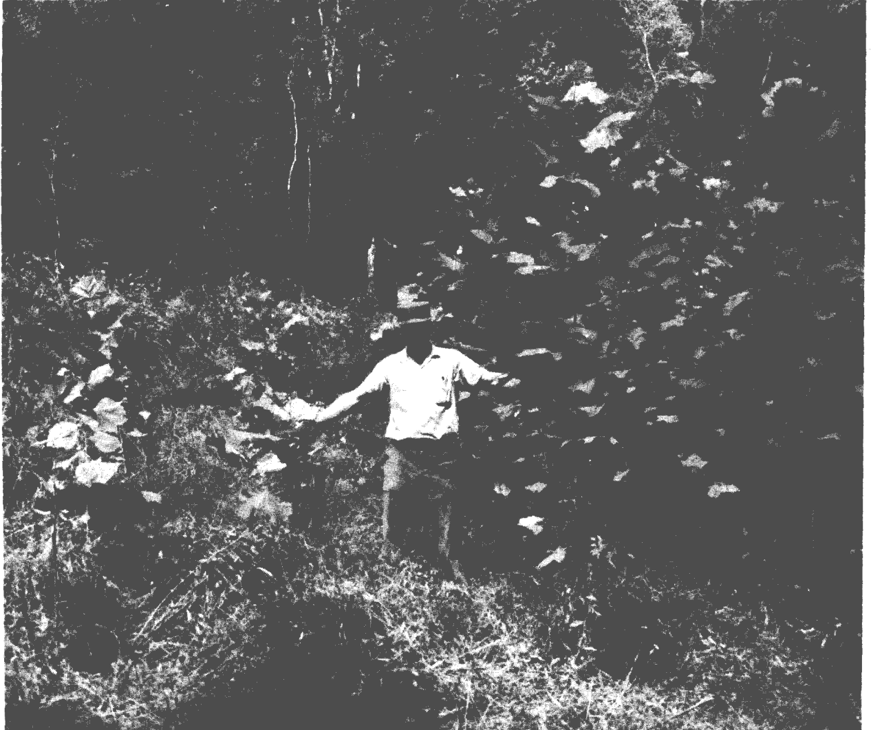
Figure 1.-- Left , Medium-size sycamore seedlings (0.31- to 0.40-inch root collar diameter) kept up with weeds (chest high before trampling); right , large seedlings outgrew weed competition.

Planting large seedlings of sycamore, as measured by root collar diameter, appears to be an effective method of achieving maximum first-year survival and growth. Rapid first-year height growth is a definite advantage on good bottom-land sites in the piedmont because weed competition is severe (fig. 1). Weed growth on these plots ranged from 4 to 8 feet, with some nearby patches even taller. Seedlings whose root collar diameters measured less than 0.30 inch were overtopped by weeds during the growing season. Medium-size seedlings (0.31- to 0.40-inch) generally held their own, except in one block where competition was most severe; the large seedlings outgrew weeds in all blocks.