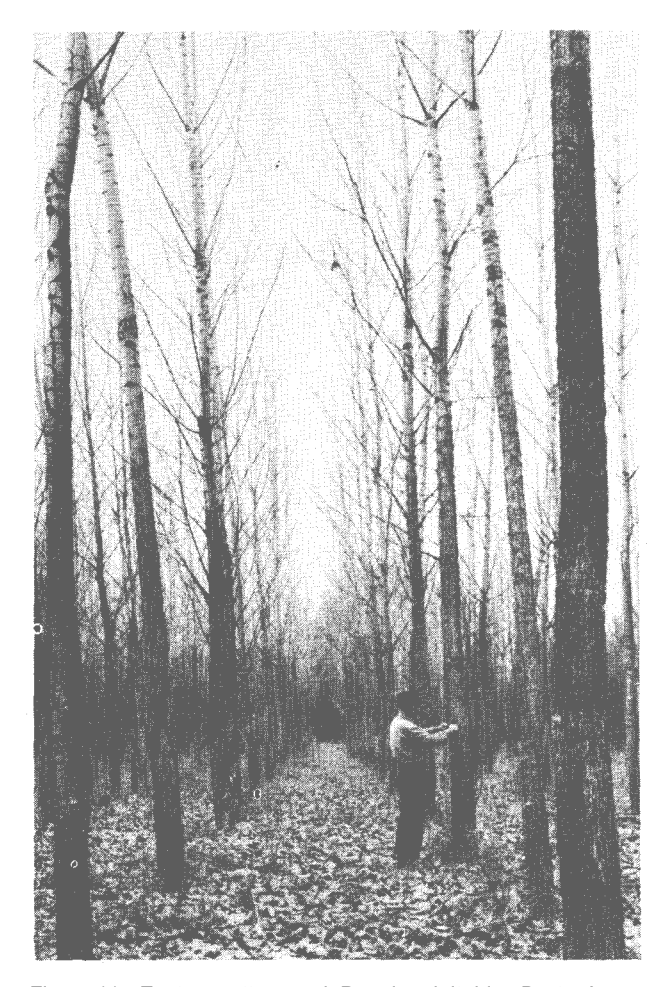
Figure 11.--Eastern cottonwood, Populus deltoides Bartr. Age 6 years.

Basal area: 60 square feet per acre (after a thinning). Diameters: 2.6-9.9 inches; average 6.4 inches. The five largest trees average 8.6 inches d.b.h., 54 feet