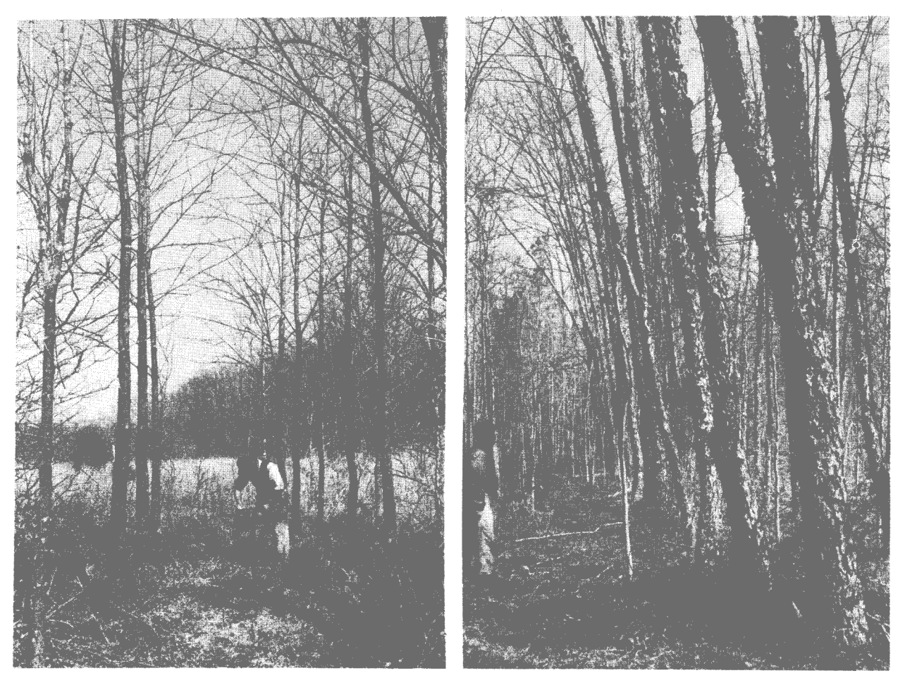
Figure 9.--Green ash, <u>Fraxinus pennsylvanica</u> Marsh. Age: 19 years. Diameters: 2.7-4.9 inches; average 3.8 inches. The five largest trees average 4.2 inches d.b.h., 39 feet tall. Falaya silt loam, dry phase.

Figure 10.--River birch, <u>Betula niqra</u> L. Age: 25 years. No measurements were made in this plantation. Ina fine sandy loam, moist phase.