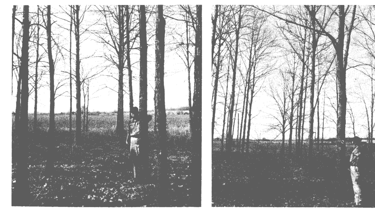
Figure I.--Southern red oak, Quercus falcata Michx. Age: 21 years.

For aid in locating the stands and providing data on their establishment, the authors thank the Chapman and Dewey Lumber Company, Tennessee Forestry Commission, Tennessee Valley Authority, and Soil Conservation Service.