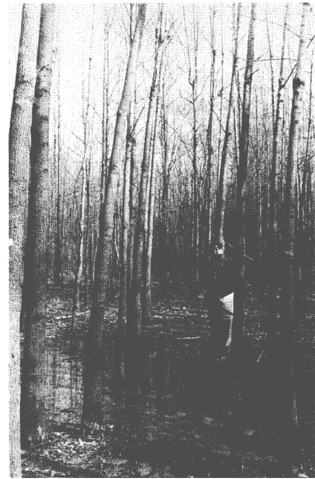
Figure 5.--Sweetgum. Age: 17 years. Survival: 39 out of 45 trees. Basal area: 153 square feet per acre. Diameters: 1.1-6.1 inches; average 3.9 inches. The five largest trees average 5.2 inches d.b.h., 42 feet