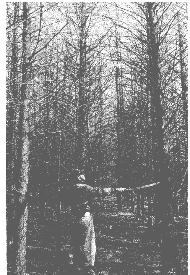
Figure 12.--Baldcypress, <u>Taxodium distichum</u> (L.) Rich. Age: 17 years. Survival: 38 trees out of 71. Basal area: 181 square feet per acre. Diameters: 2.0-12.2 inches; average 6.6 inches.