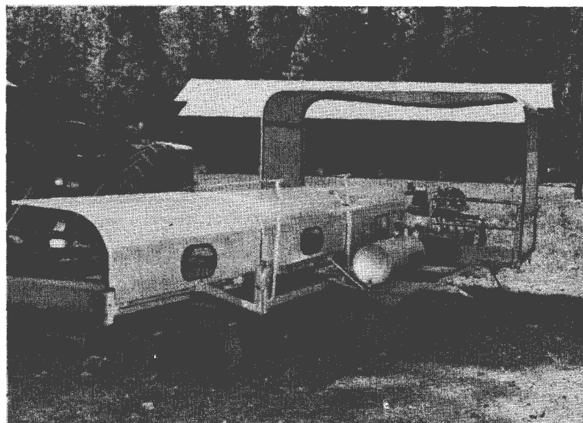
Figure 1: -Front view of seedling harvester showing location of compressor unit and water tank for the mist sprayer.

The mist sprayer at Mt. Shasta Nursery was made from an old paint sprayer and is simple and easy to operate. Air pressure is supplied by an internal piston-type, gasoline-powered compressor, mounted on the back of the drawbar of the seedling harvester (fig. 1). The water tank, also mounted on the drawbar, holds about 20 gallons