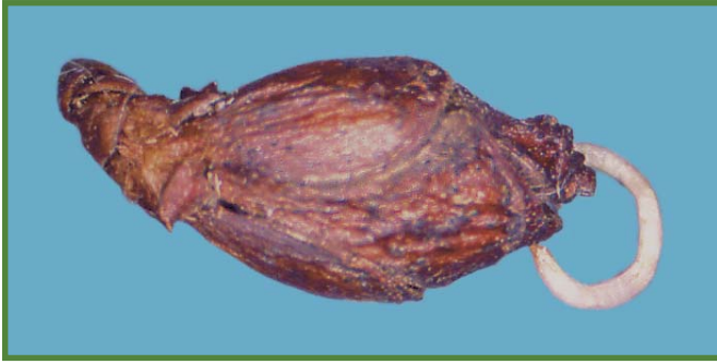
Figure 36 Premature germination of western redcedar in the cone.

The BC Ministry of Forests has not encouraged cone collection from squirrel caches since the late 1970s. It is briefly mentioned here to reinforce what we know with regard to the seeds or cold fungus. Cones have been traditionally collected from squirrel caches because it is relatively inexpensive and the collection period is much greater than with other methods. Observations appear to indicate that squirrels do not begin significant storage of cones until the seeds are mature. However, it must not be assumed that all cones and seeds are mature. Cached cones may require extra care and handling in interim storage. After dropping cones from trees, squirrels gather and place cones in piles or caches. These caches are usually located in cool shady areas and their biggest threat from seed-borne fungal pathogens comes from Caloscypha . If cones must be collected from squirrel caches, follow these recommendations to improve seed extractability and reduce the risk to seed-borne infection. Only collect cones from the top of the cache—buried, wet, or excessively dirty cones must be left behind. Clean collected cones of as much debris as possible prior to storage and give close attention to proper drying, as they are often wetter than cones collected using other methods.