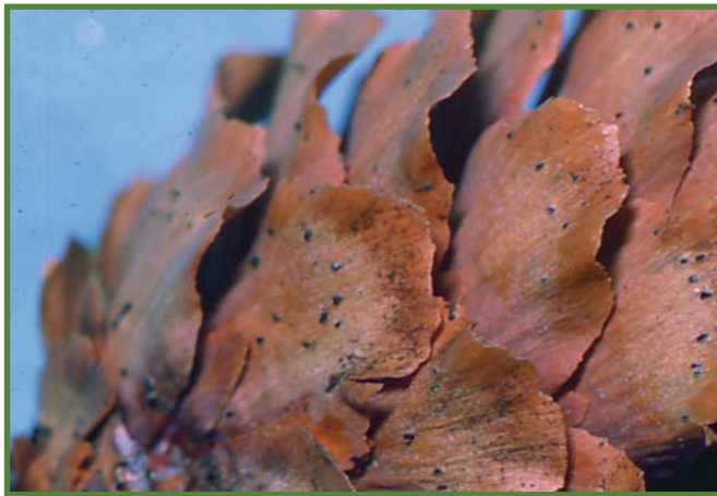
Figure 34 Avoid collecting old cones with Sirococcus fruiting bodies (pycnidia) on them.

later. If all the cones knocked to the ground can not be collected immediately they risk exposure to Caloscypha , especially if left for extended periods in cool wet weather. Cones collected in this manner should be removed from the ground as quickly as possible. Otherwise, spread tarpaulins under the trees to separate the fallen cones from the duff. A common Sirococcus point of entry to the seed handling system occurs when old cones which have fruiting bodies on them (Figure 34), are included with the new cones collected from under trees. Ensure that pickers are diligent to avoid the inclusion of old cones in collections.