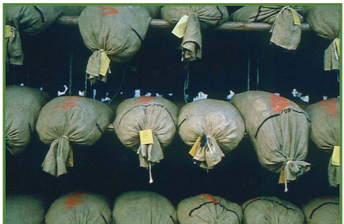
Figure 37 Cones should be stored on well-ventilated racks in clean dry sacks.

but they also should not be allowed to remain wet for excessively long periods as this will encourage the spread of any fungal growth. Remember that air movement is more beneficial to drying than light or heat and that shade or