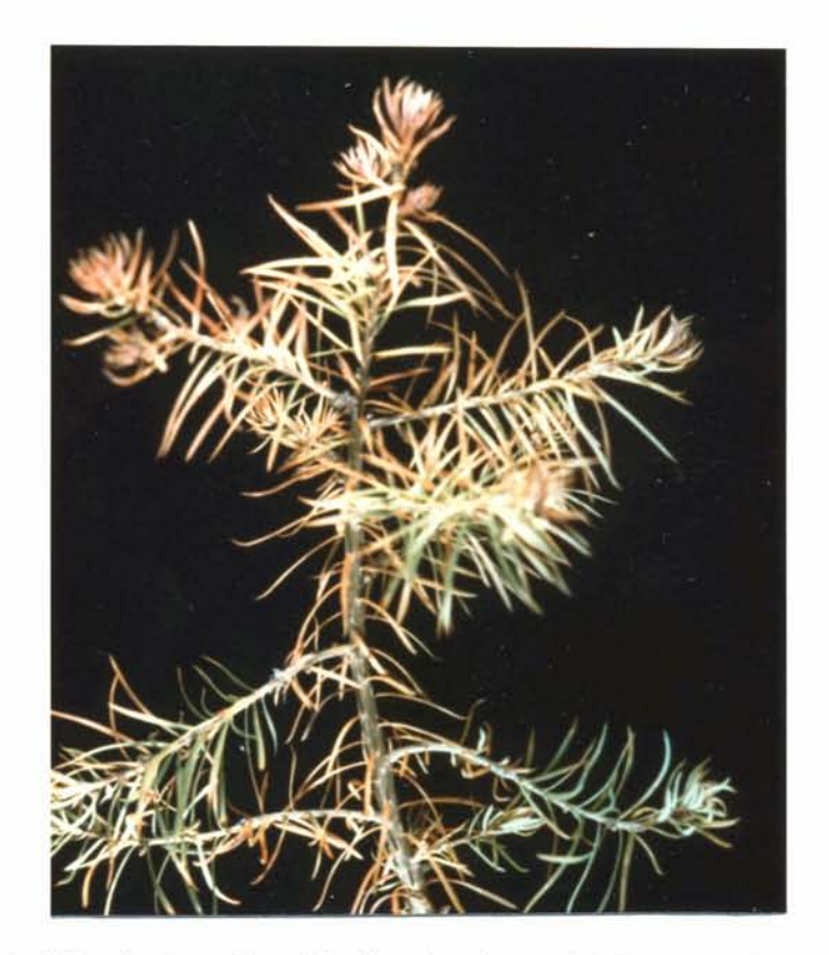
Figure 2. Containerized Douglas-fir seedling with chlorotic and necrotic foliage 1 year following outplanting at the early selection trial site, Montana State Nursery, Missoula.