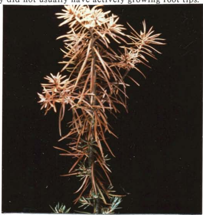
Figure 1. Containerized Douglas-fir seedling with necrotic foliage concentrated at the top of the seedling which may be indicative of winter drying.

Containerized Douglas-fir (Pseudotsuga menziesii Franco) seedlings grown at the USDA Forest Service Nursery in Coeur d'Alene, Idaho, were outplanted in 1986 on a site at the Montana State Nursery in Missoula as an early selection trial in the Northern Region's tree improvement program. In the spring of 1987, several of the seedlings were dead or dying. Affected seedlings were in various stages of decline with both chlorotic and necrotic foliage. Some seedlings had necrotic foliage at their tops while the lower needles were mostly green (fig. 1). Such symptoms resembled those caused by winter drying (when the foliage above the snowline dries out because of excessive transpiration that cannot be replaced because the roots are in frozen soil). Other seedlings had their entire foliage necrotic (fig. 2). Roots of affected seedlings were not extensively decayed (fig. 3); however, they did not usually have actively growing root tips.