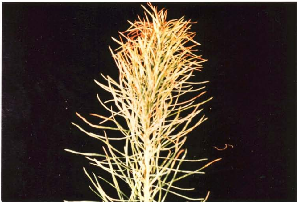
Figure 1.--Tip dieback symptoms of containerized lodgepole pine seedling (#5) from the Champion Timberlands Nursery, Plains, Montana.