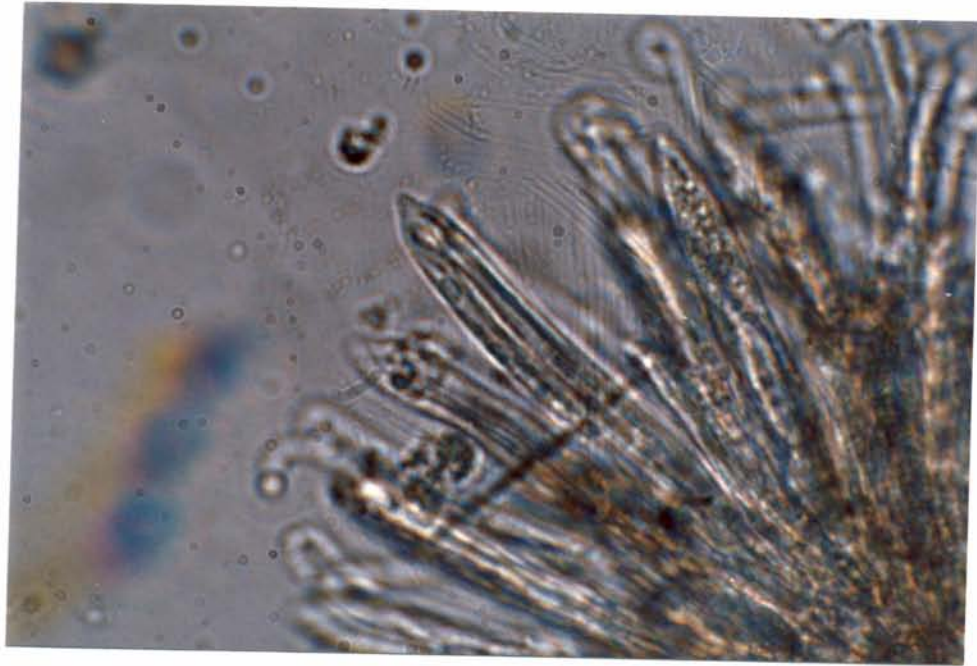
Figure 3.--Photomicrograph of asci intermingled with slightly longer hooked paraphyses (x450). Asci are clavate to cylindrical and contain eight filiform ascospores which are forcibly released, windborne, and cause needle infection.

Fungal infection of needle tips did not affect first season survival of transplanted seedlings (table 1). Although several seedlings died, they were not killed by needle fungi. Rather, their roots were dead and were probably injured or desiccated prior to transplanting.