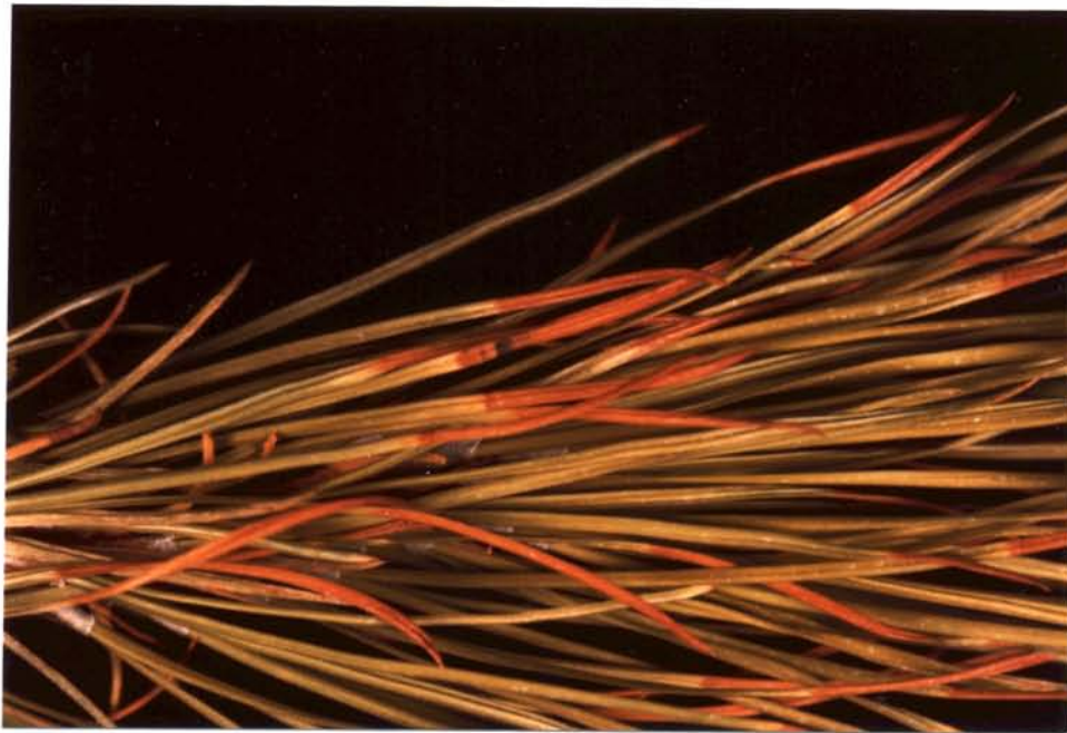
Figure 1.--Needle tip dieback of 2-0 ponderosa pine seedling produced at the Coeur d'Alene Nursery. Necrotic tips were usually colonized by Lophodermium nitens and several other secondary saprophytic fungi.