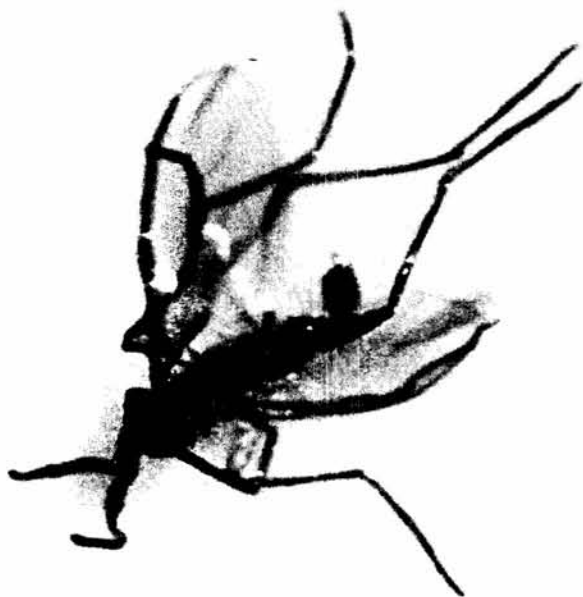
Figure 1—Adult fungus gnat ( Bradysia sp.) as it appears on a yellow sticky card.

media in the laboratory. Standard potato dextrose agar and an agar medium selective for Fusarium spp. and closely related organisms (Komada 1975) were used. This latter medium is often used to isolate root pathogenic fungi from conifer seedlings. Selected fungi emerging from trapped fungus gnats were maintained in pure culture for identification purposes. Whenever possible, single-spore isolates were derived. Several taxonomic compilations were used for fungal identification (Dorenbosch 1970, Barnett and Hunter 1972, Domsch and others 1980, Nelson and others 1983).