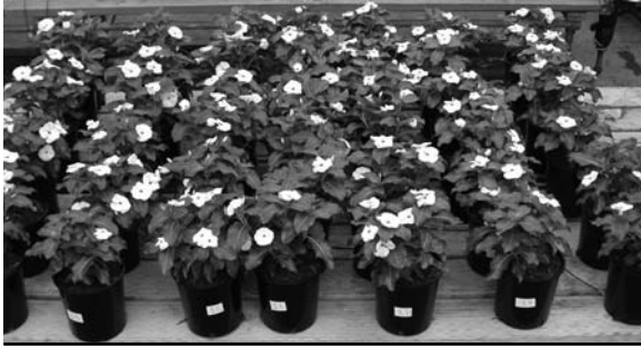
Figure 1. Annual vinca growth (shoot dry weight) resulting from 2 bark ages and 3 micronutrient sources at 6 weeks after planting (Experiment 1). No significant differences in growth between fresh and aged bark, or the 3 micronutrient sources.